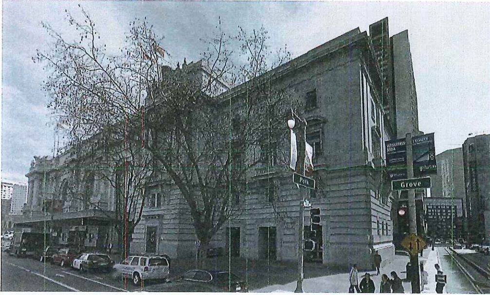
BILL GRAHAM CIVIC AUDITORIUM