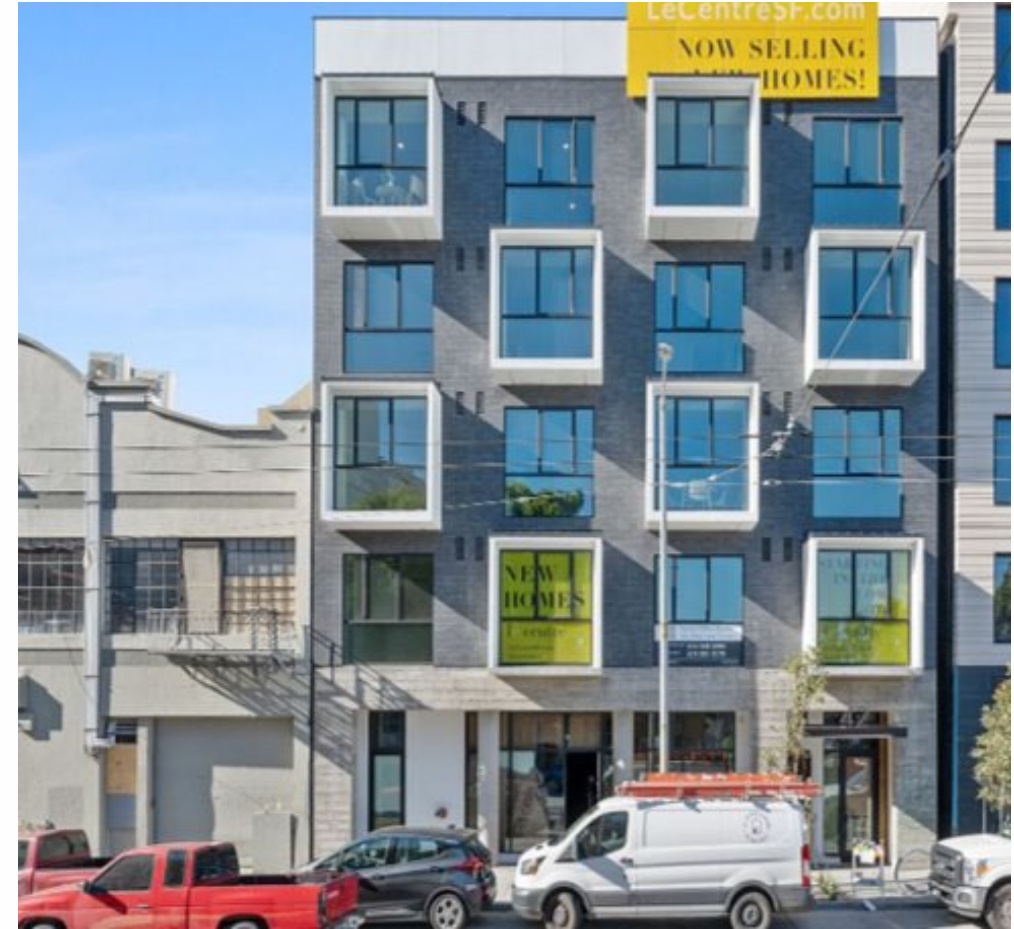
42 Otis Street