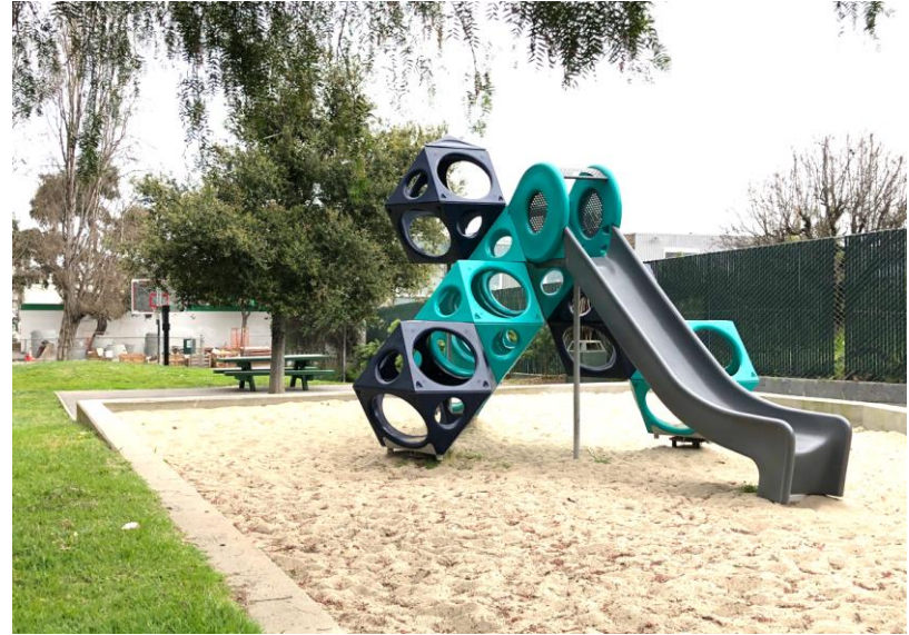
Selby Palou Mini Park