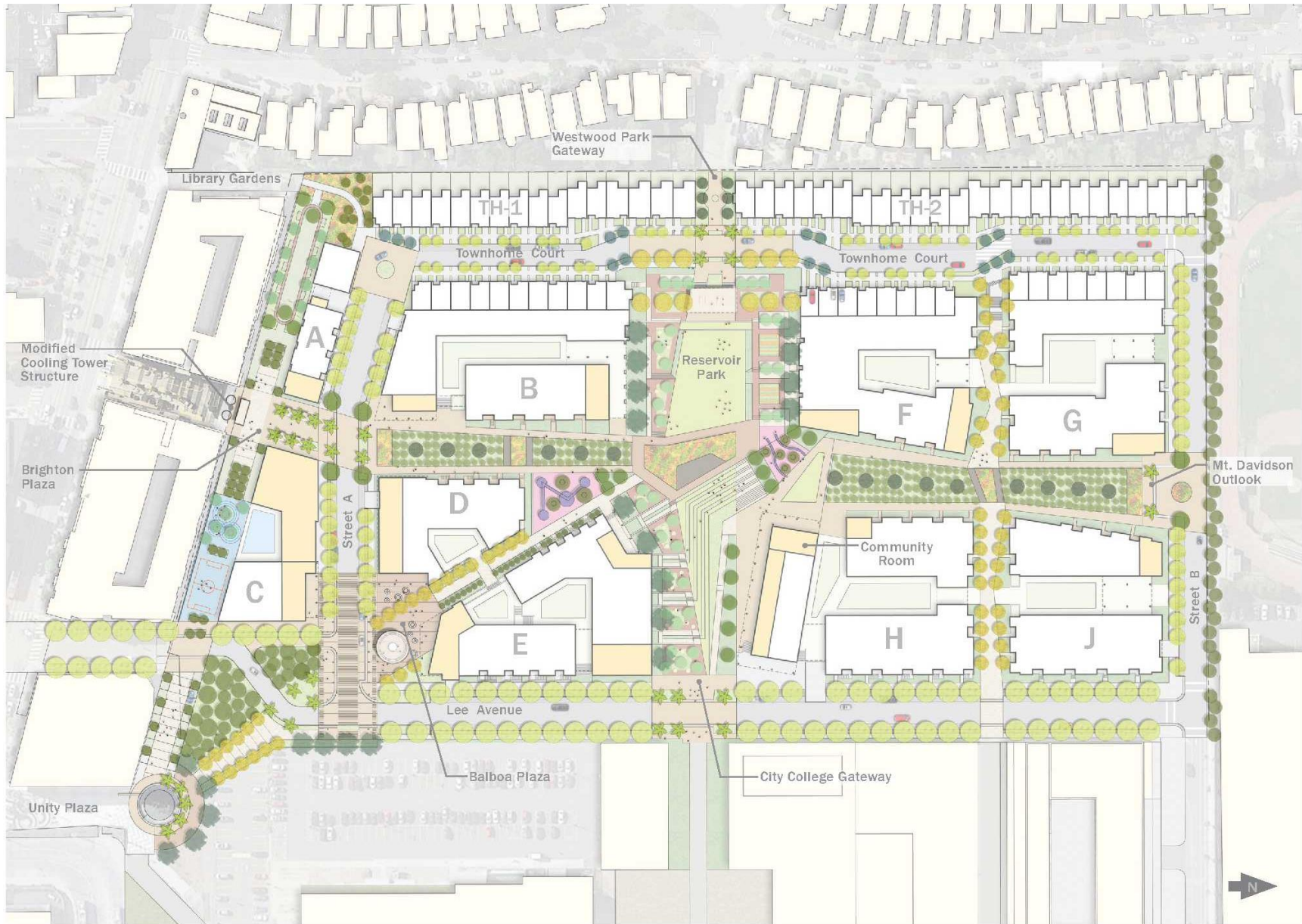
Exhibit B Preliminary Site Plan