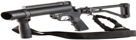
Model 1426-11 Shown