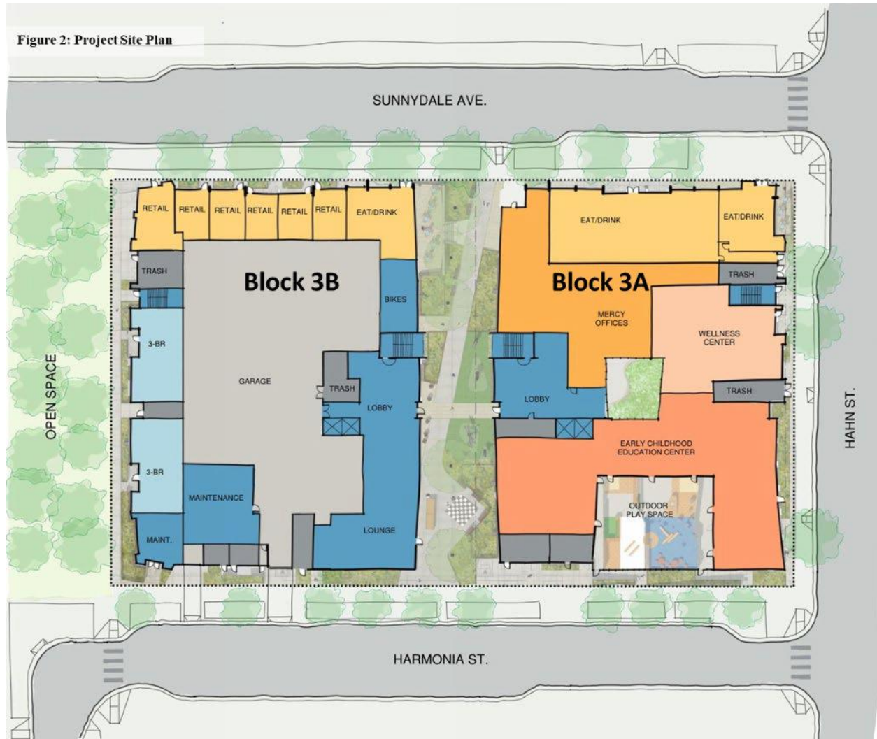
Exhibit 2: Sunnydale HOPE SF Blocks 3A and 3B