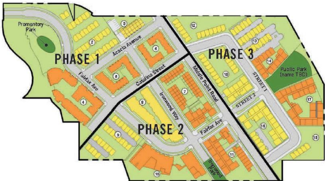
Exhibit 1: Hunters View Development Plan

Source: MOHCD Loan Evaluation for Hunters View Phase III Note: Public & Affordable Housing is on Blocks 4, 5, 6 7, 10, 14, & 17