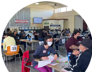
INTEGRATED IMMIGRANT SERVICES