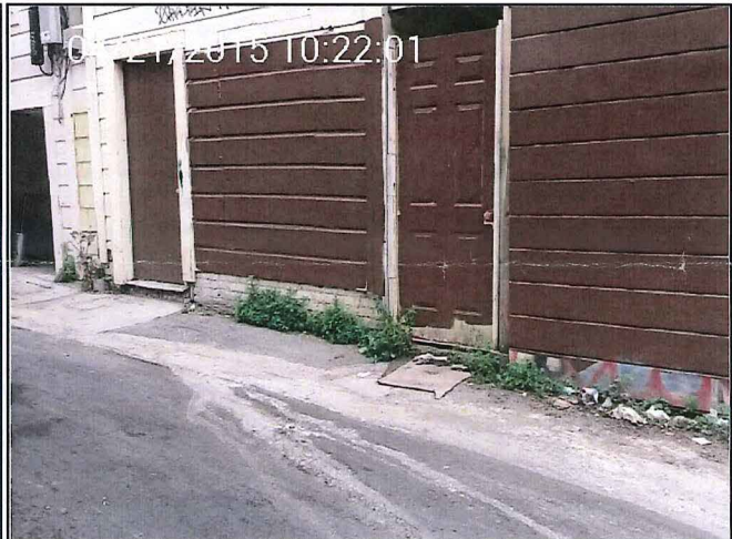
abated - 04/21/2015