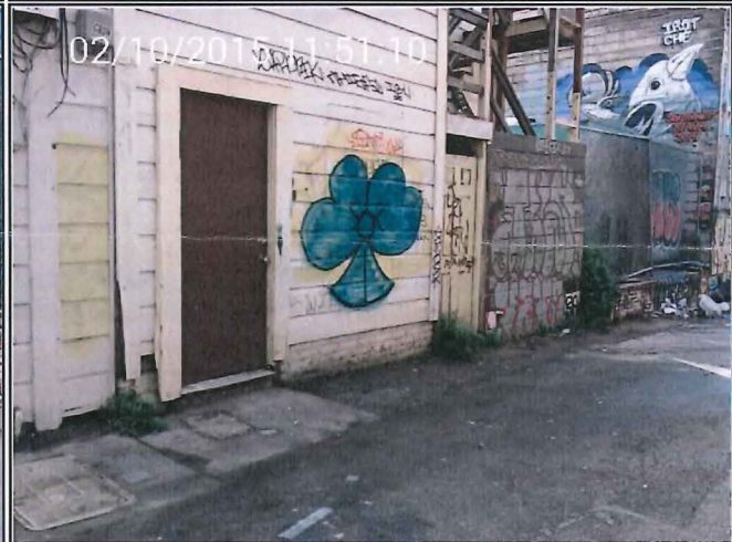
not abated - 02/10/2015