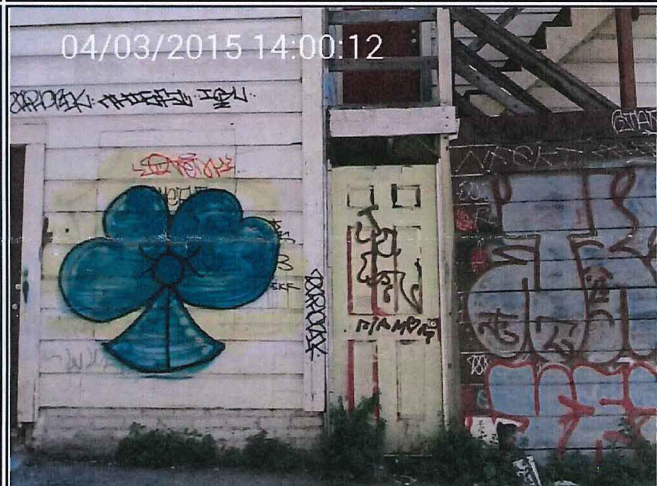
not abated - 04/03/2015