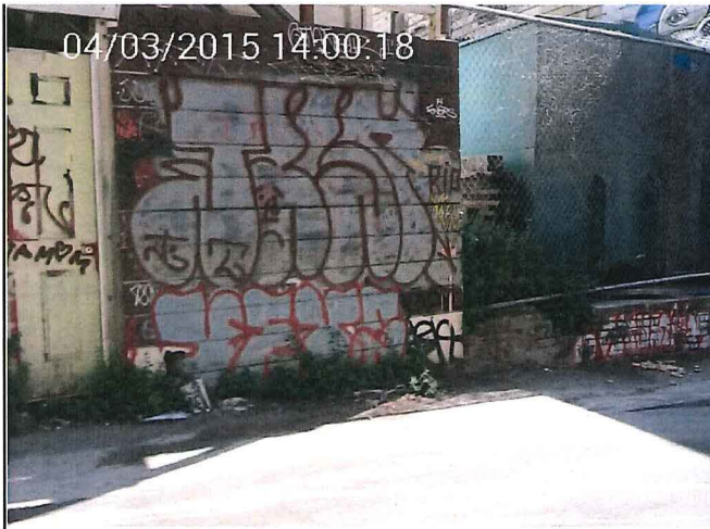
not abated - 04/03/2015