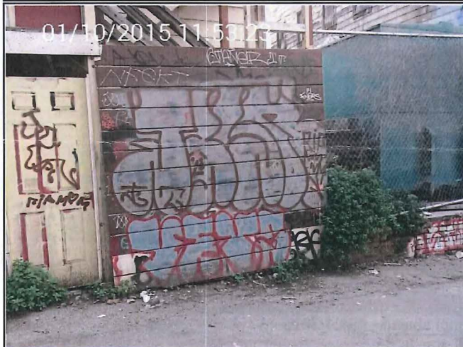
nov - 01/10/2015