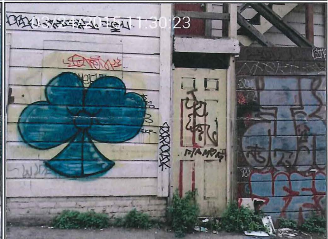
not abated - 03/24/2015