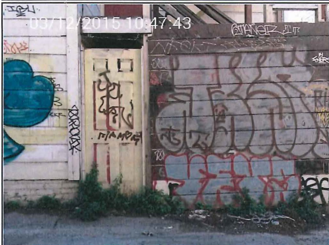
not abated - 03/12/2015