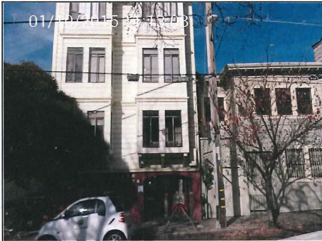
nov - 01/10/2015