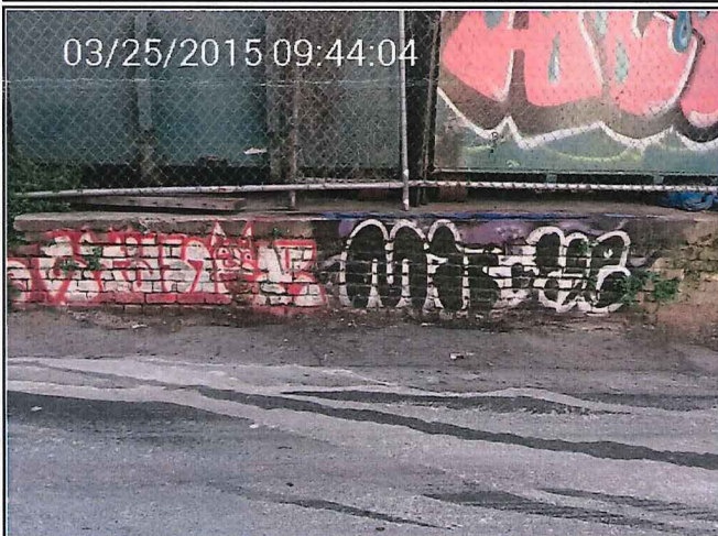
not abated - 03/25/2015