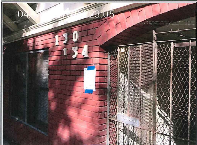
blight posted - 04/08/2015