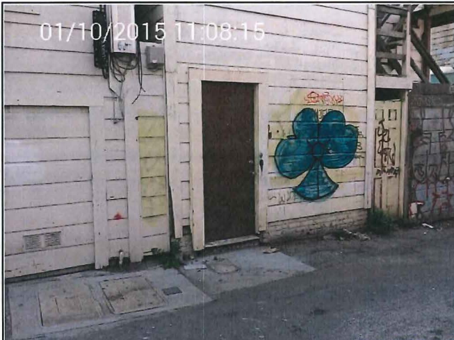
nov - 01/10/2015