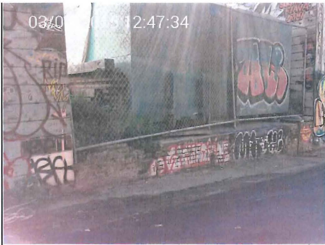
not abated - 03/04/2015