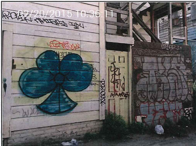
not abated - 02/20/2015