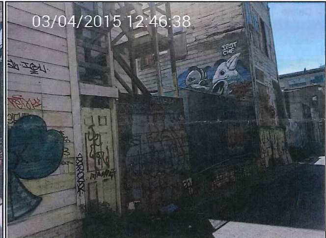
not abated - 03/04/2015