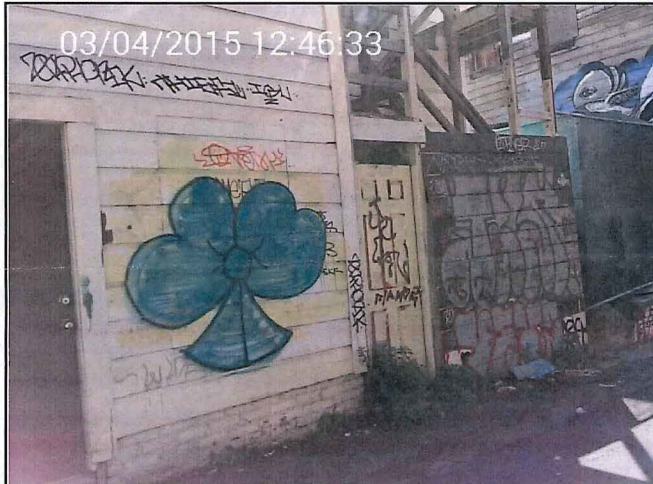
not abated - 03/04/2015