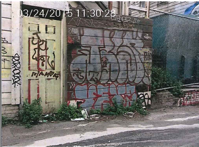
not abated - 03/24/2015