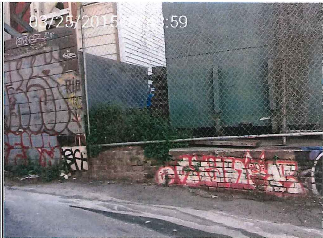
not abated - 03/25/2015