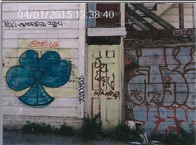
not abated - 04/01/2015