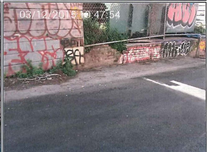
not abated - 03/12/2015