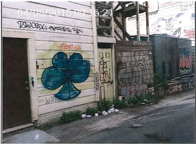
blight posted - 04/08/2015