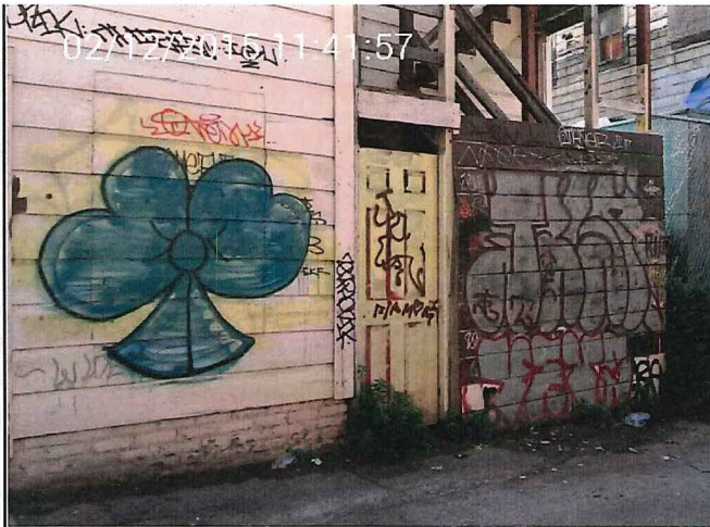
not abated - 02/12/2015