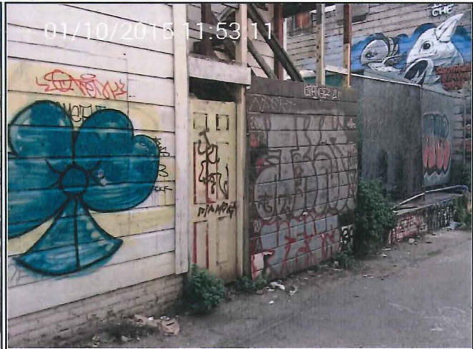
nov - 01/10/2015