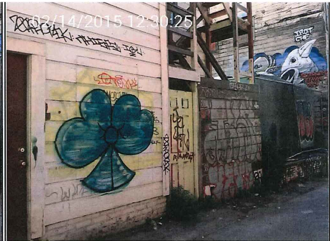
not abated - 02/14/2015