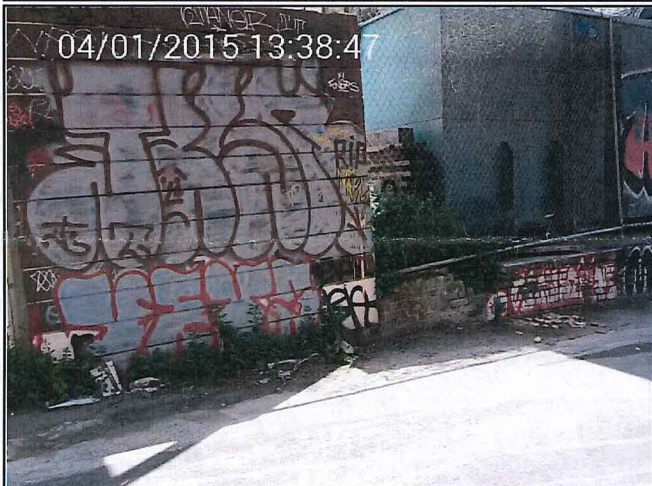
not abated - 04/01/2015