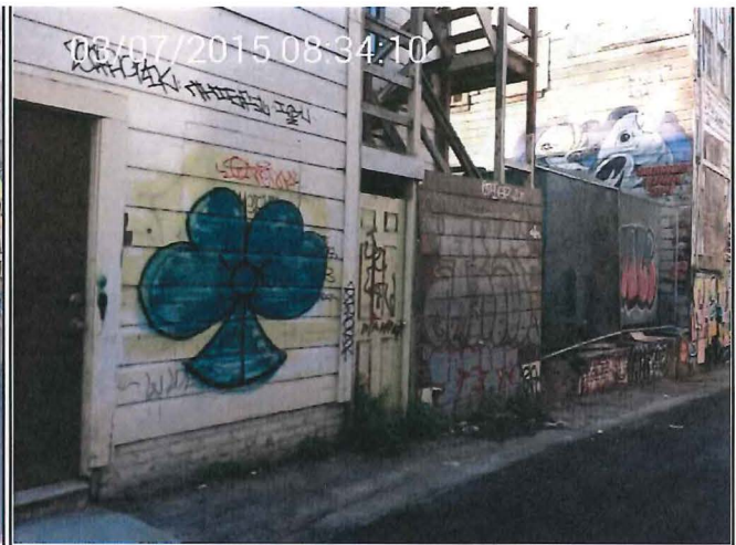
nov - 03/07/2015