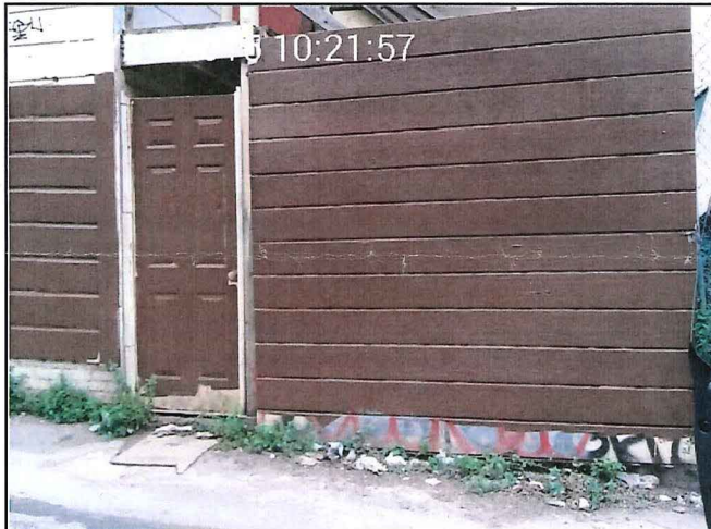
abated - 04/21/2015