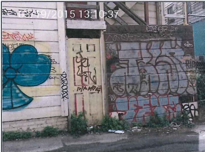
not abated - 03/19/2015