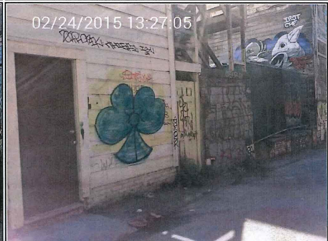
not abated - 02/24/2015