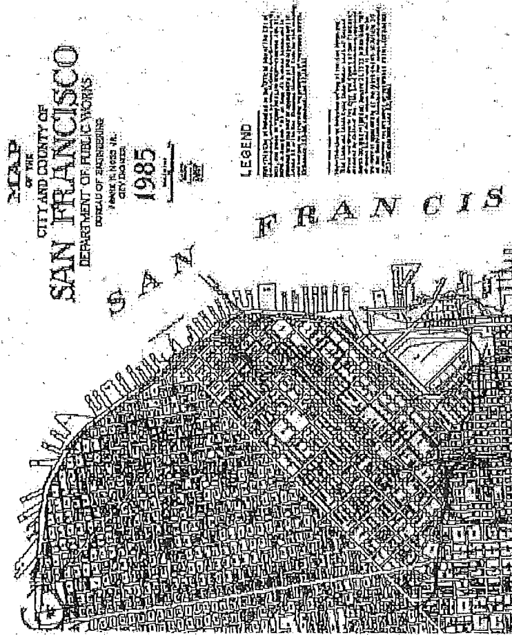
FIGURE 1A-I-1851 HIGH-TIDE LINE MAP

Standard Plan Review Hourly Rate - Minimum Four Hours