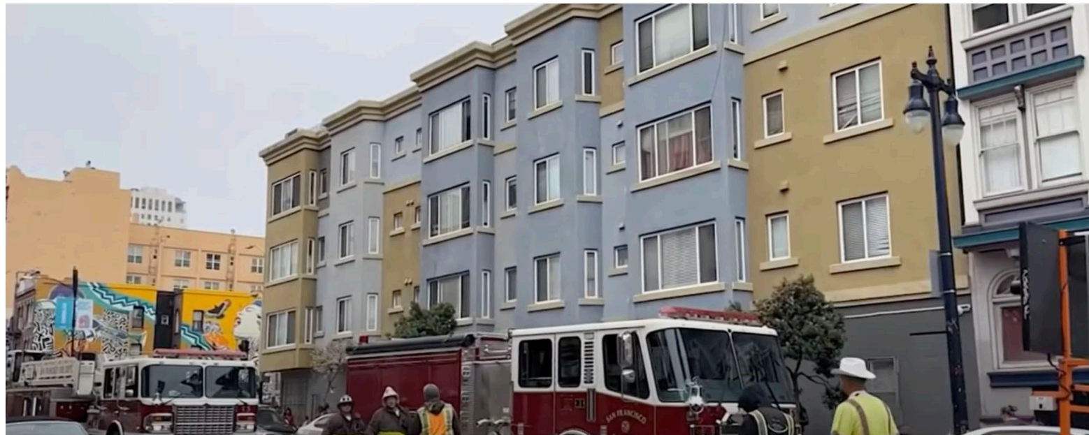
LITHIUM BATTERY SPARKS APARTMENT FIRE SAN FRANCISCO