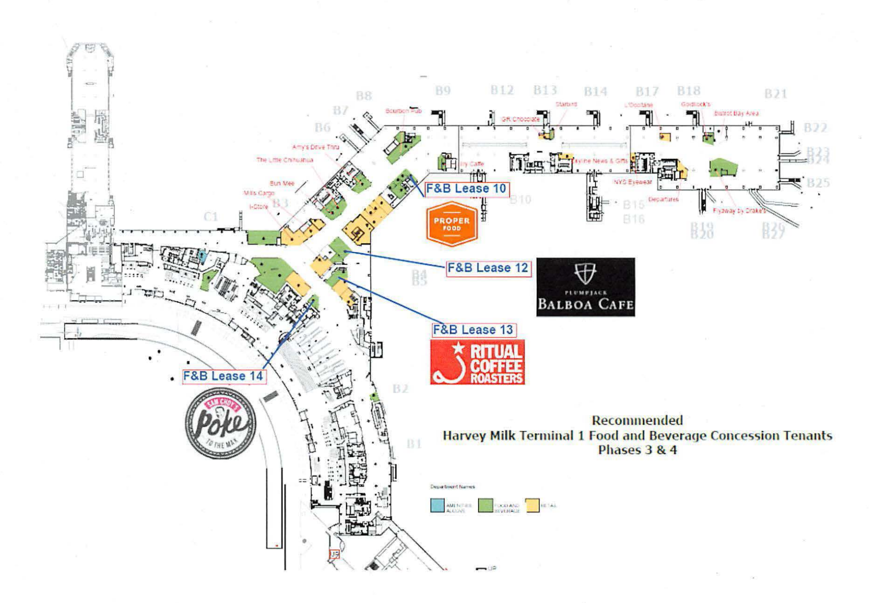
Attachment 1 HARVEY MILK TERMINAL 1 FOOD AND BEVERAGE CONCESSIONS LEASES IN PHASES 3 & 4