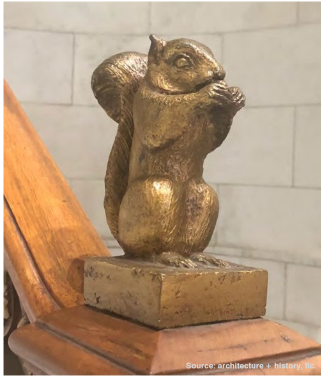
1908 lobby with elevators, marble stairs and squirrel newel post, 2019