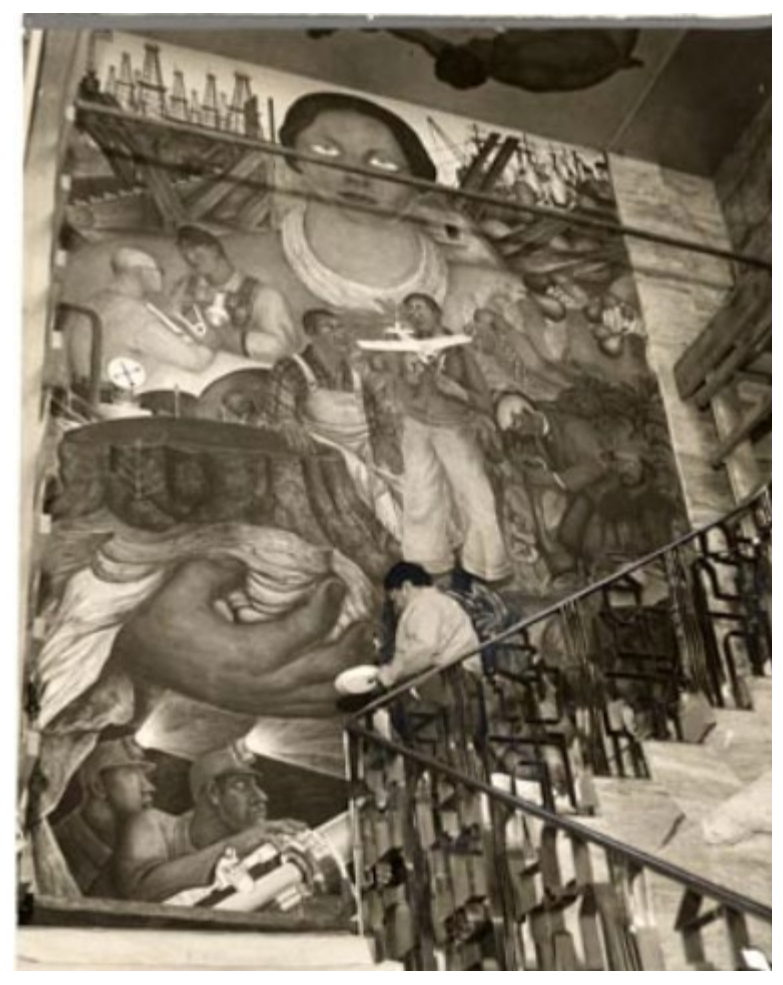
Diego Rivera putting finishing touches on fresco decorating wall of Stock Exchange, February 27, 1931.