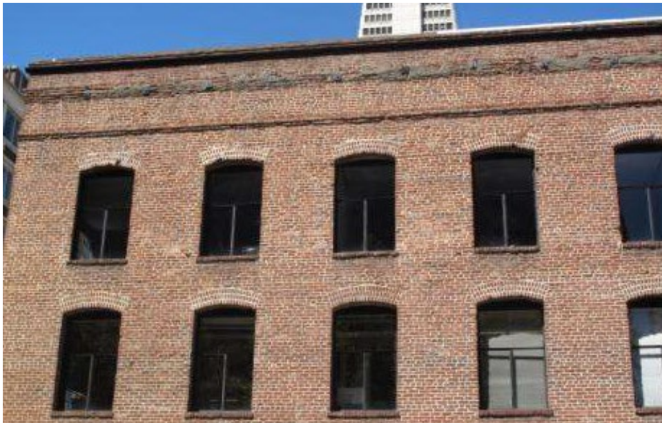
Above: Detail of upper story windows at Battery Street, 2017