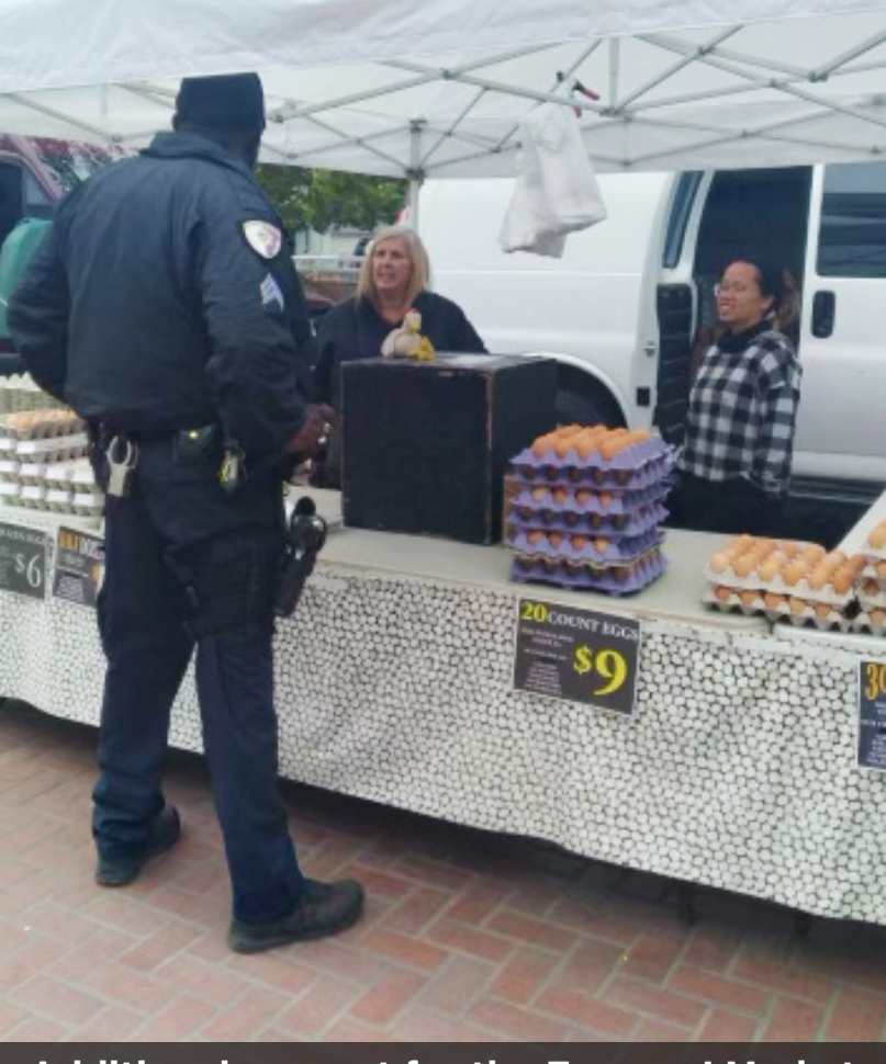
Additional support for the Farmers' Market