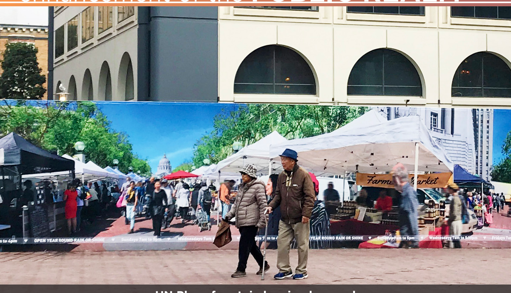
UN Plaza fountain barricade mural