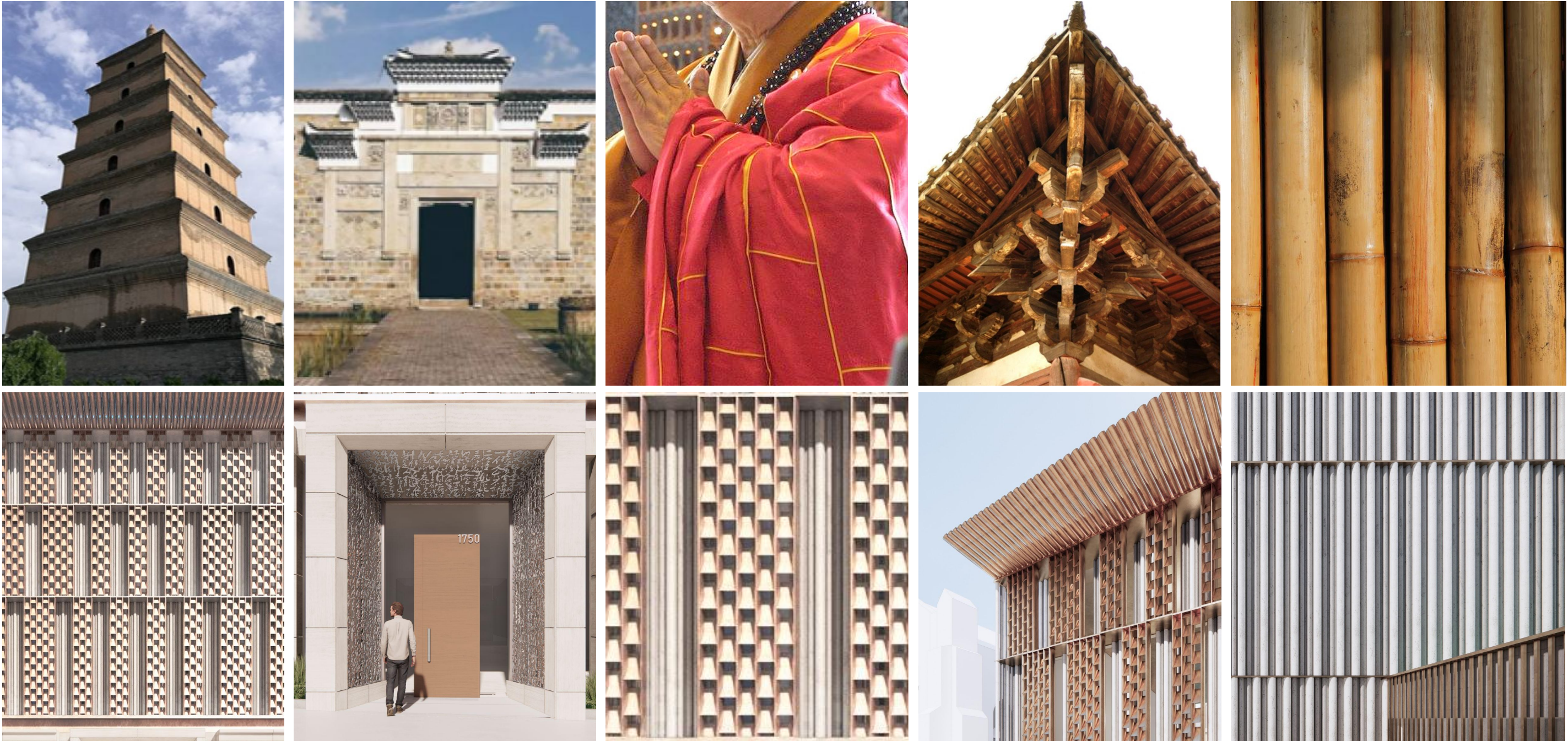
ABCS TEMPLE SKIDMORE, OWINGS & MERRILL