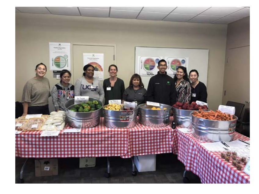
Mount Zion (UCSF) Food Pharmacy, 2019