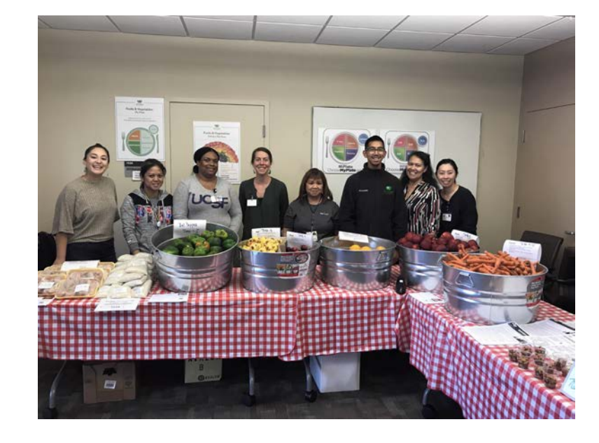
Mount Zion (UCSF) Food Pharmacy, 2019