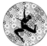
AFRICAN AMERICAN ART & CULTURE COMPLEX