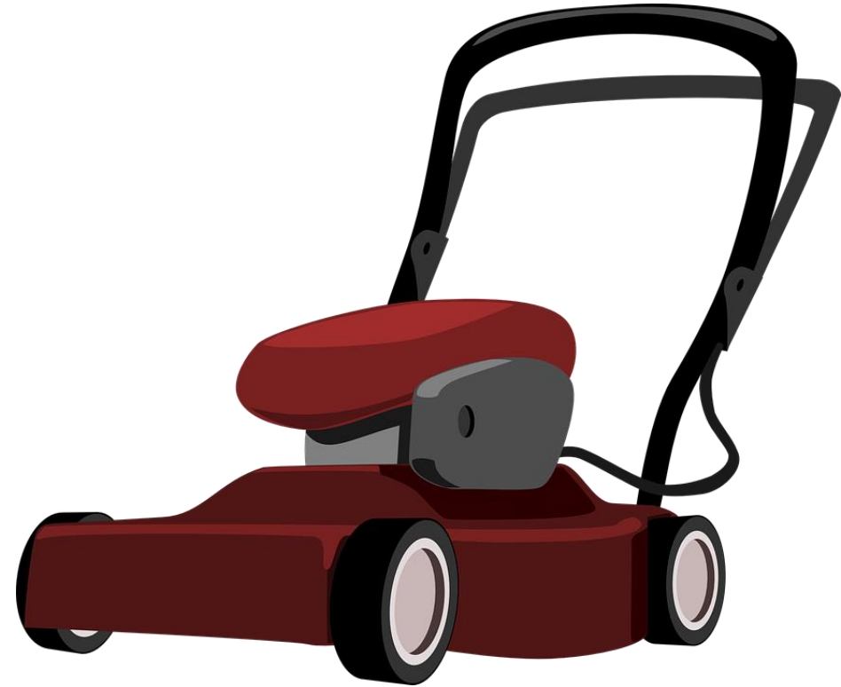
Lawn mower – 94 decibels