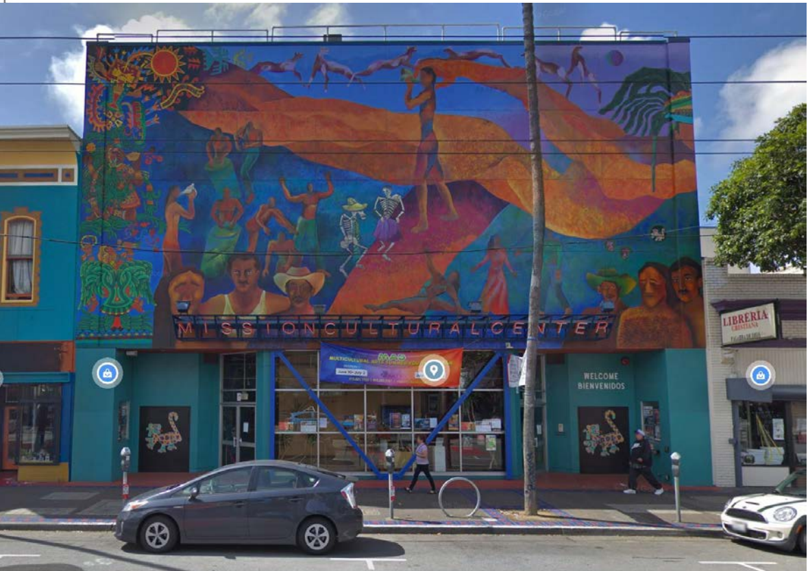
Mission Cultural Center for Latino Arts Building, 2868 Mission Street