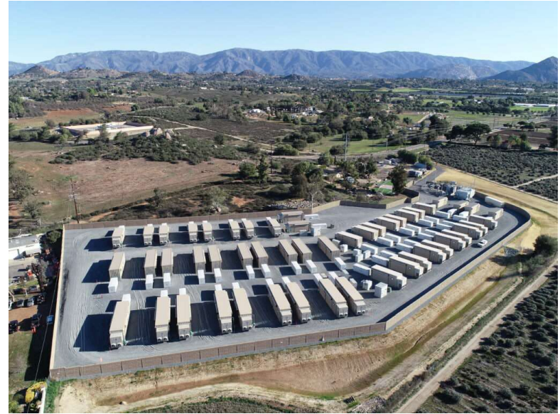
Example: 140 MW Valley Center Battery Storage Project