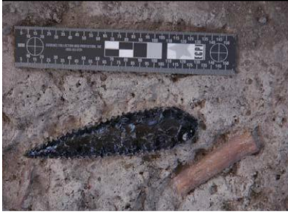
Native American tools including obsidian and bone