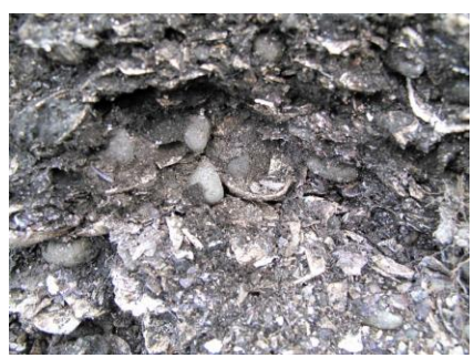
Close-up of shell deposit