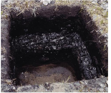
Shell deposit, often in dark soil