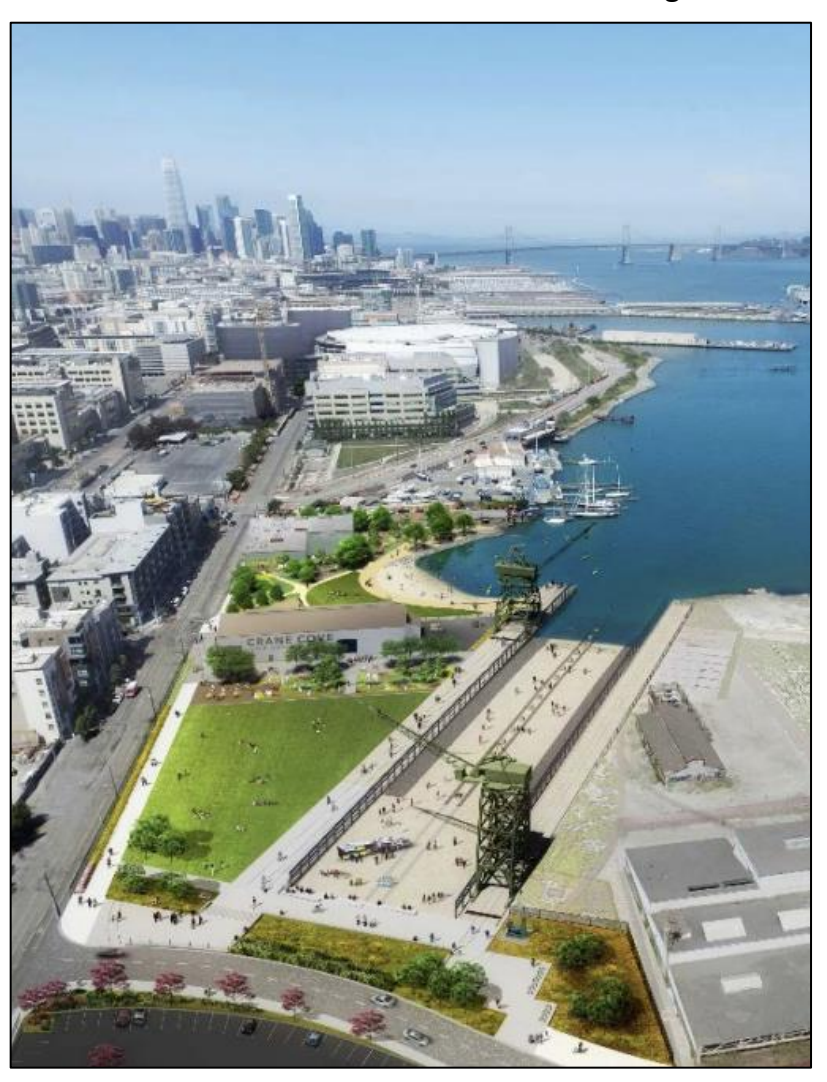
Exhibit 2: Crane Cove Park Architectural Rendering