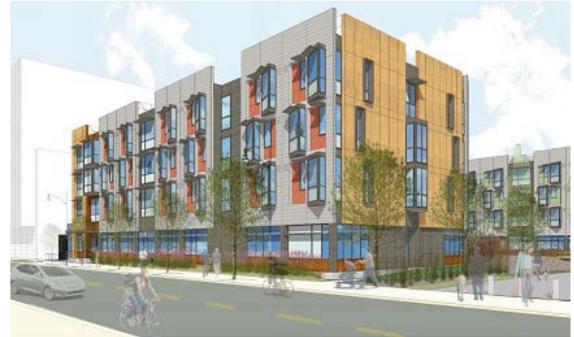
Mission Bay Block 9 Supportive Housing