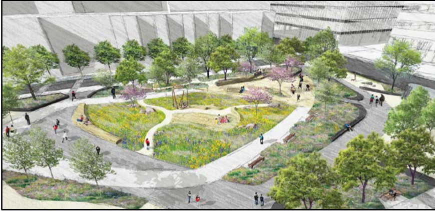
Transbay Block 3 Park