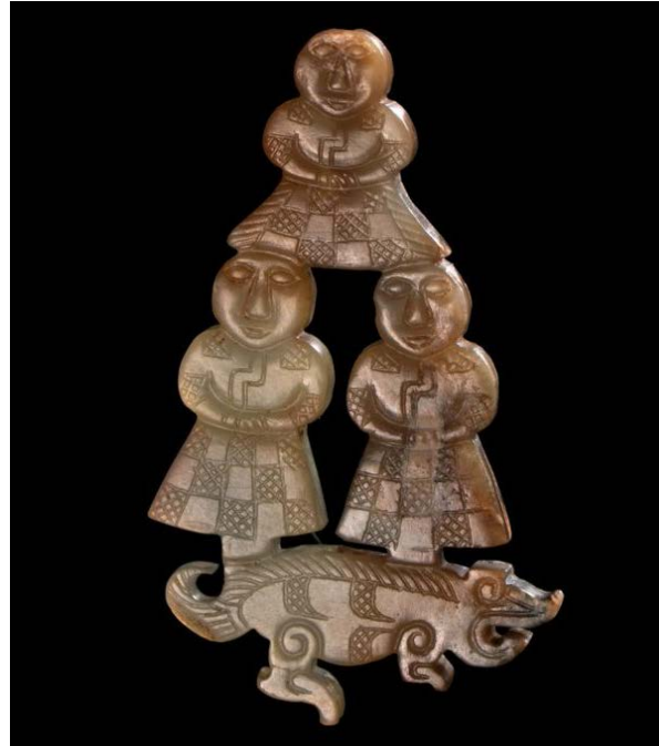
Lost Kingdoms Sept 23, 2022 – Feb 6, 2023