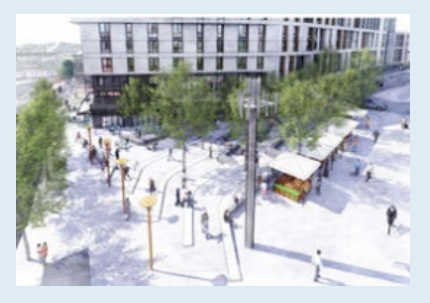
BART Station Improvements