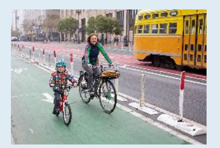
Protected Bike Lanes