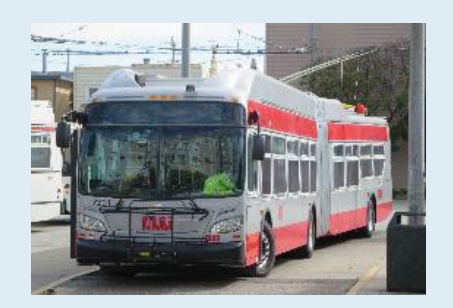
New Muni Vehicles: Motor Coaches, Trolleybuses, Light Rail