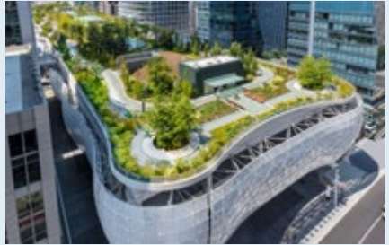
Salesforce Transit Center