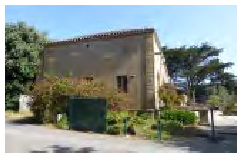
Mother's Building, north elevation (L) and south elevation (R), 2015.