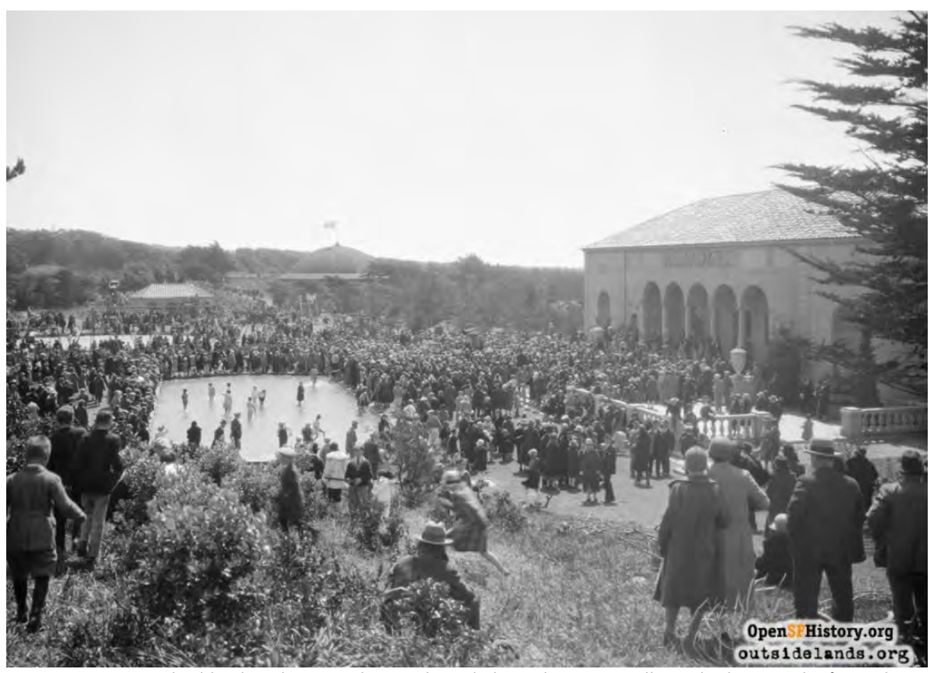
Easter Egg Hunt at Fleishhacker Playground, near Sloat Blvd & 45th Ave. Overall view looking south of crowds, wading pool, swings, merry go round. Mother's Building at right. April 11, 1936