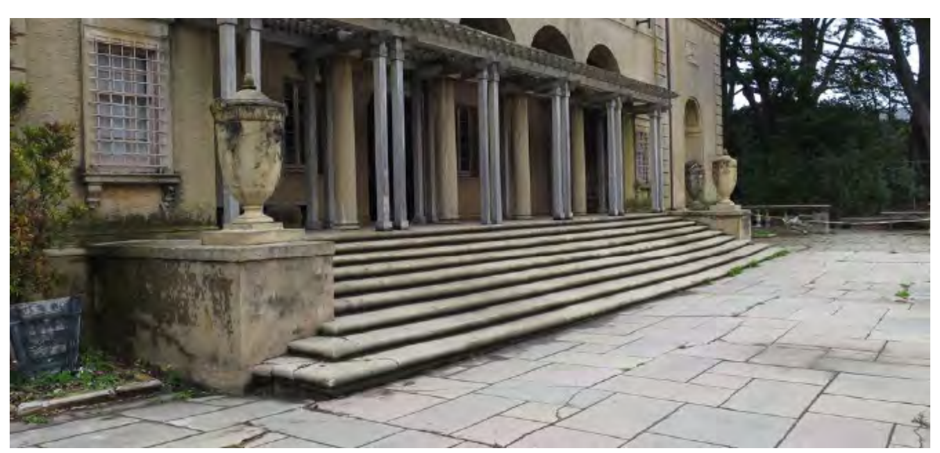
Mother's Building, terrace/plaza and entrance stairs at east elevation, view northwest, 2016.