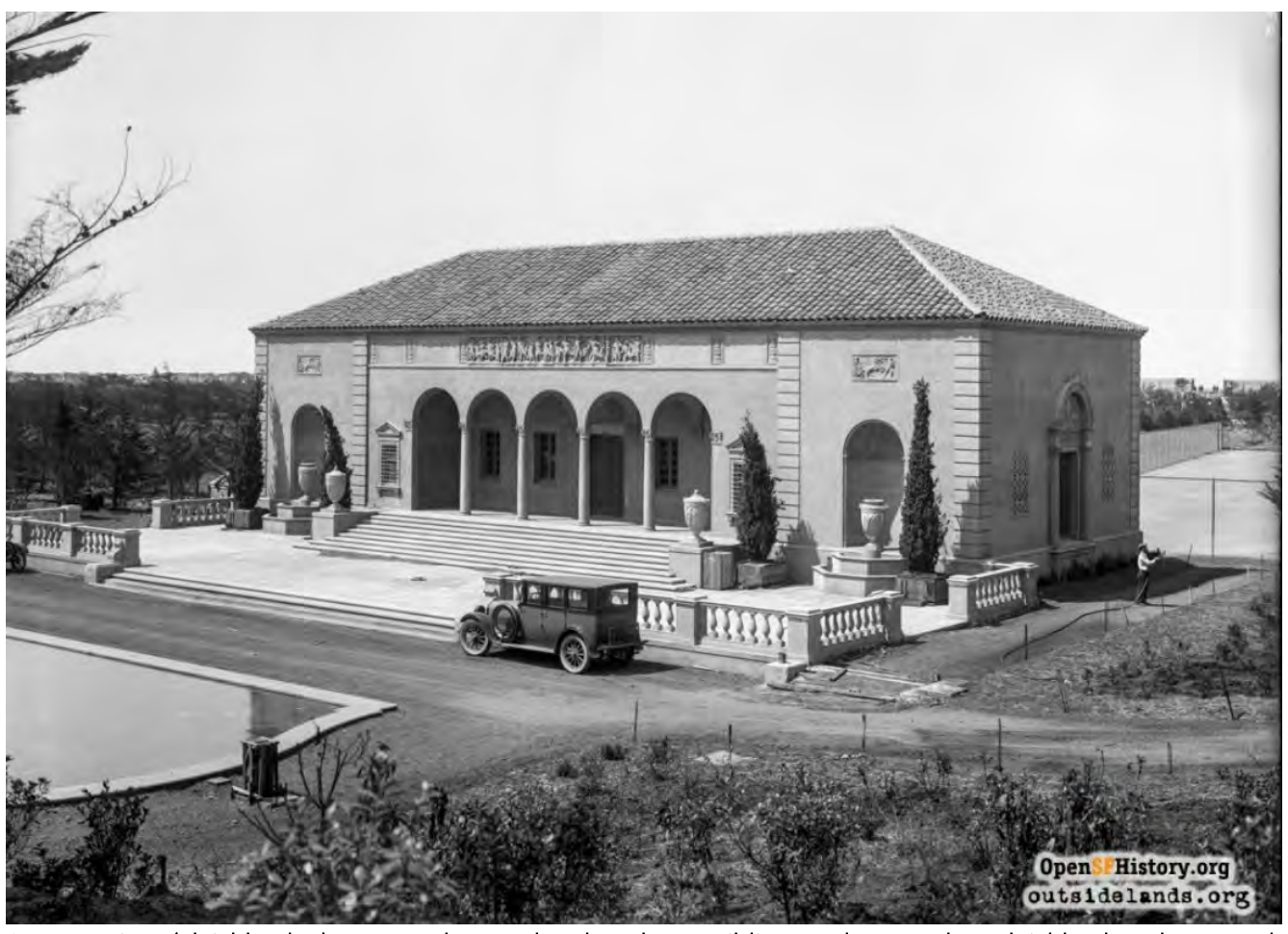
San Francisco (Fleishhacker) Zoo. Newly completed Mothers Building at what was then Fleishhacker Playground. 1925