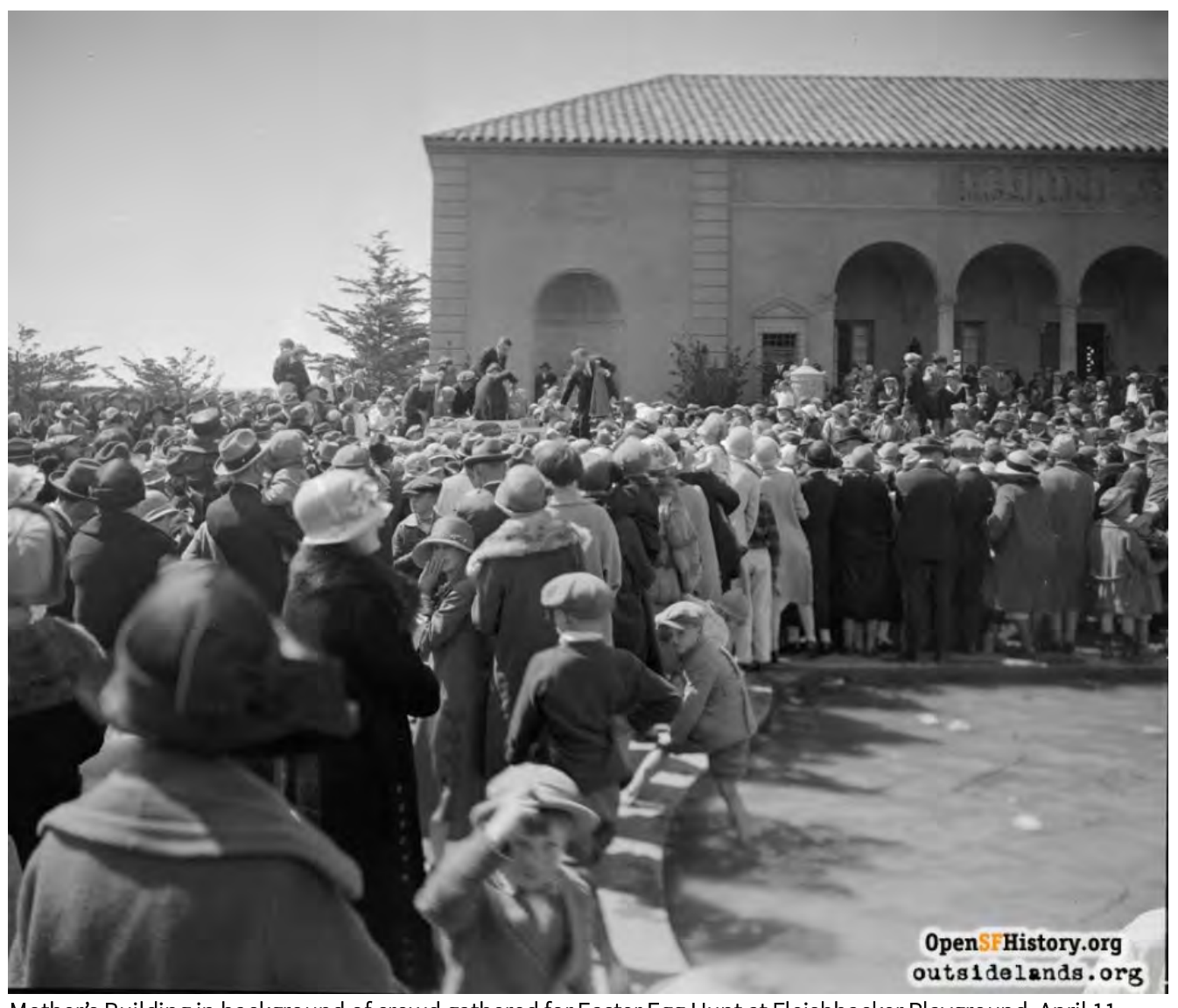
Mother's Building in background of crowd gathered for Easter Egg Hunt at Fleishhacker Playground, April 11, 1926.