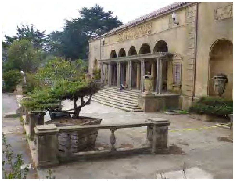
Mother's Building, east elevation and terrace/plaza, view south, 2015.