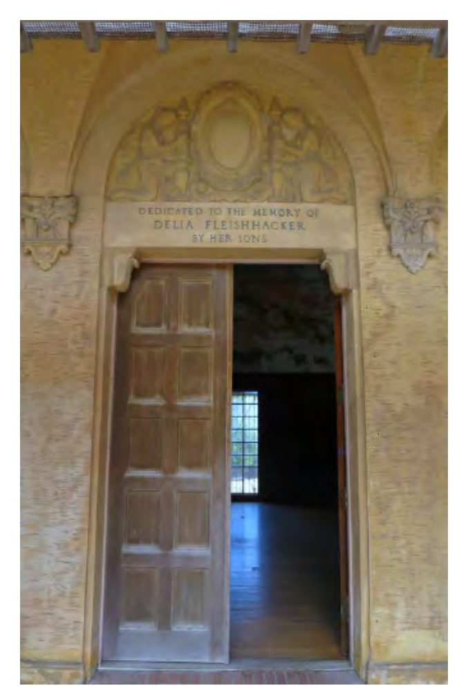
Mother's Building, main entrance, view west, 2016.