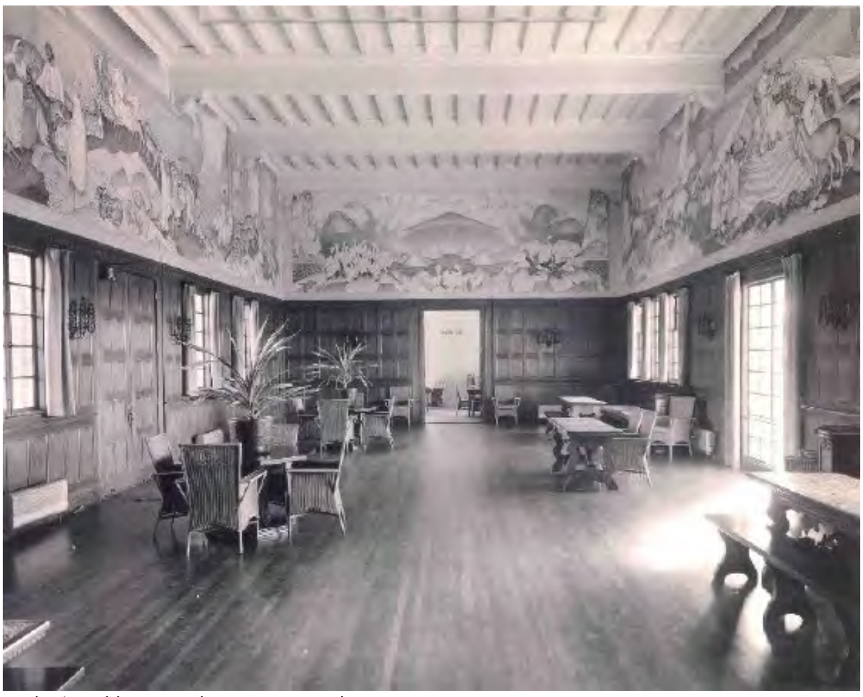
Mother's Building, main lounge, view north, 1939.