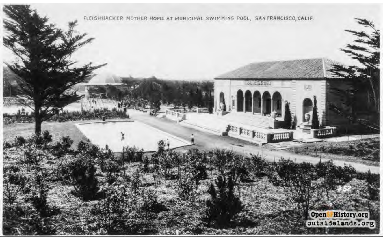
Mother's Building with playground and wading pool and merry-go-round in background, circa 1925.