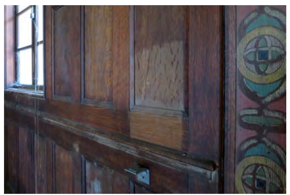
Building, detail of painted door surrounds in main lounge, 2016.