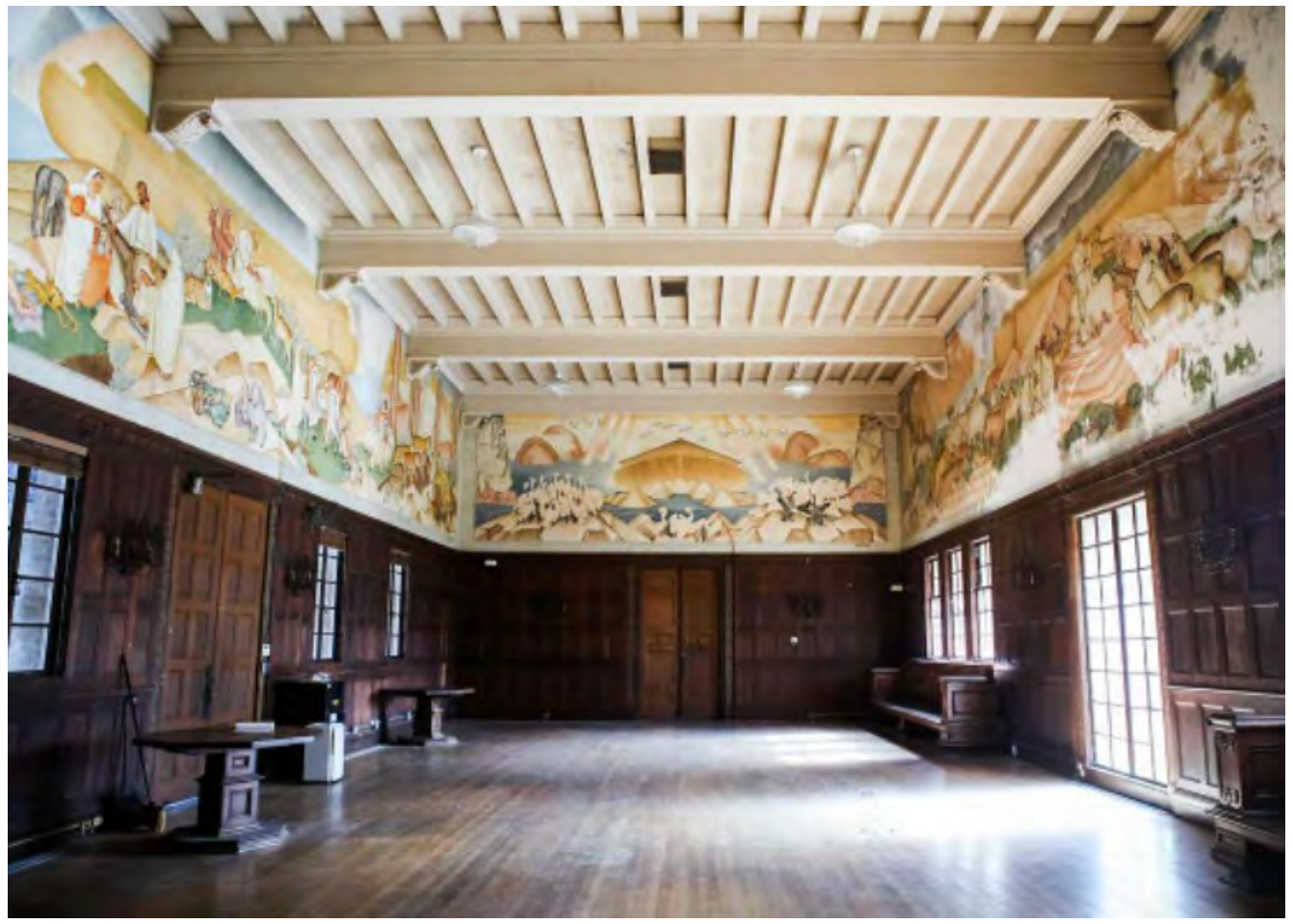
Mother's Building, main room with murals depicting scenes from Noah's Ark, view north, 2016.

Source: Caille Millner, "Mother's Building could use some love this Mother's Day," San Francisco Chronicle , April 29, 2016. Photographer: Gabrielle Lurie. Accessed at <a href="https://www.sfchronicle.com/art/article/Mothers-Building-could-use-some-love-this-7383823.php#photo-9896877">https://www.sfchronicle.com/art/article/Mothers-Building-could-use-some-love-this-7383823.php#photo-9896877</a>