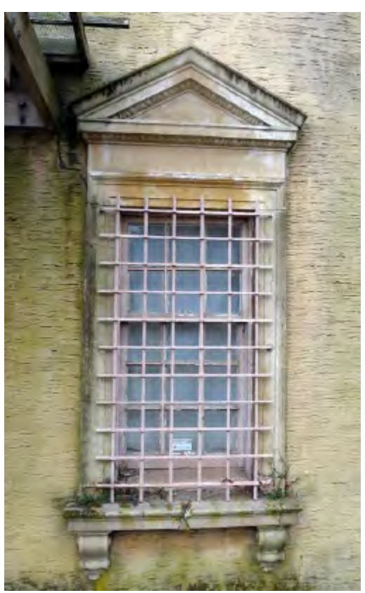
Mother's Building, window and surround, 2016.