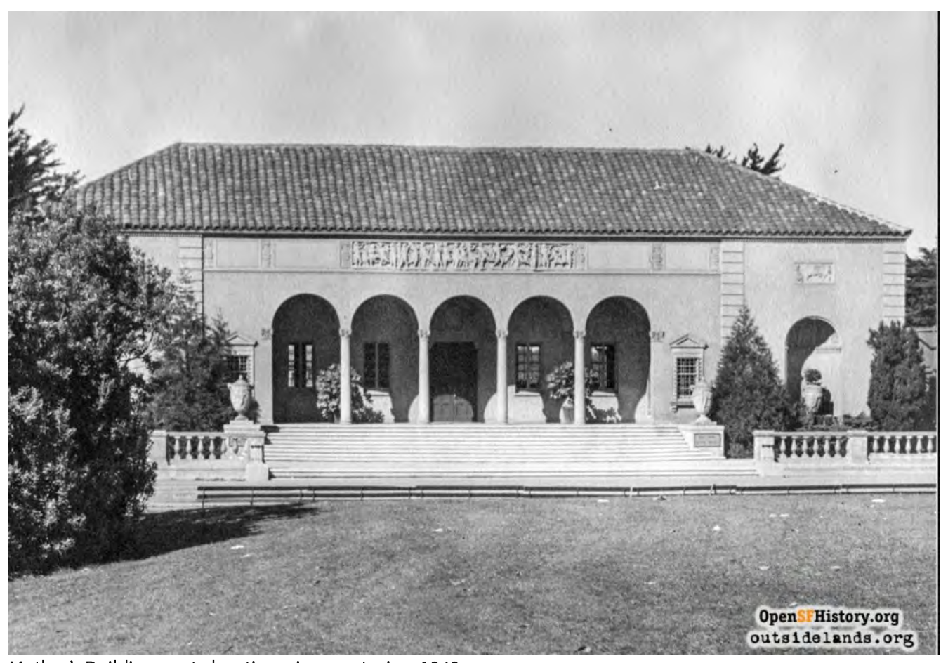
Mother's Building, east elevation, view west, circa 1940.