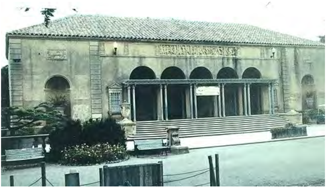
Mother's Building, east elevation, view west, circa 2005.