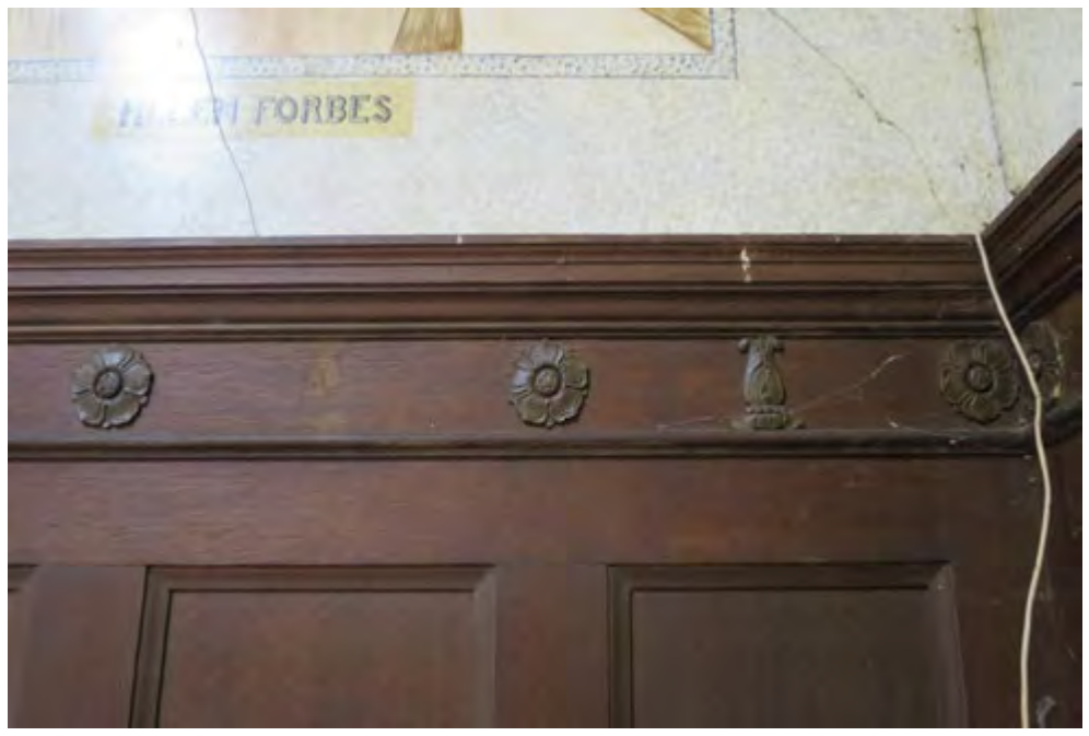
Mother's Building, detail of metal motifs at wainscoting in main lounge, 2016.