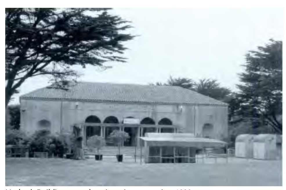
Mother's Building, east elevation, view west, circa 1990.