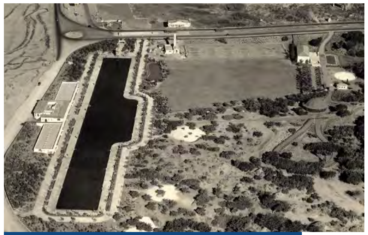
Fleishhacker Pool, aerial view, Dec. 5, 1925. Mother's Building at upper right corner.