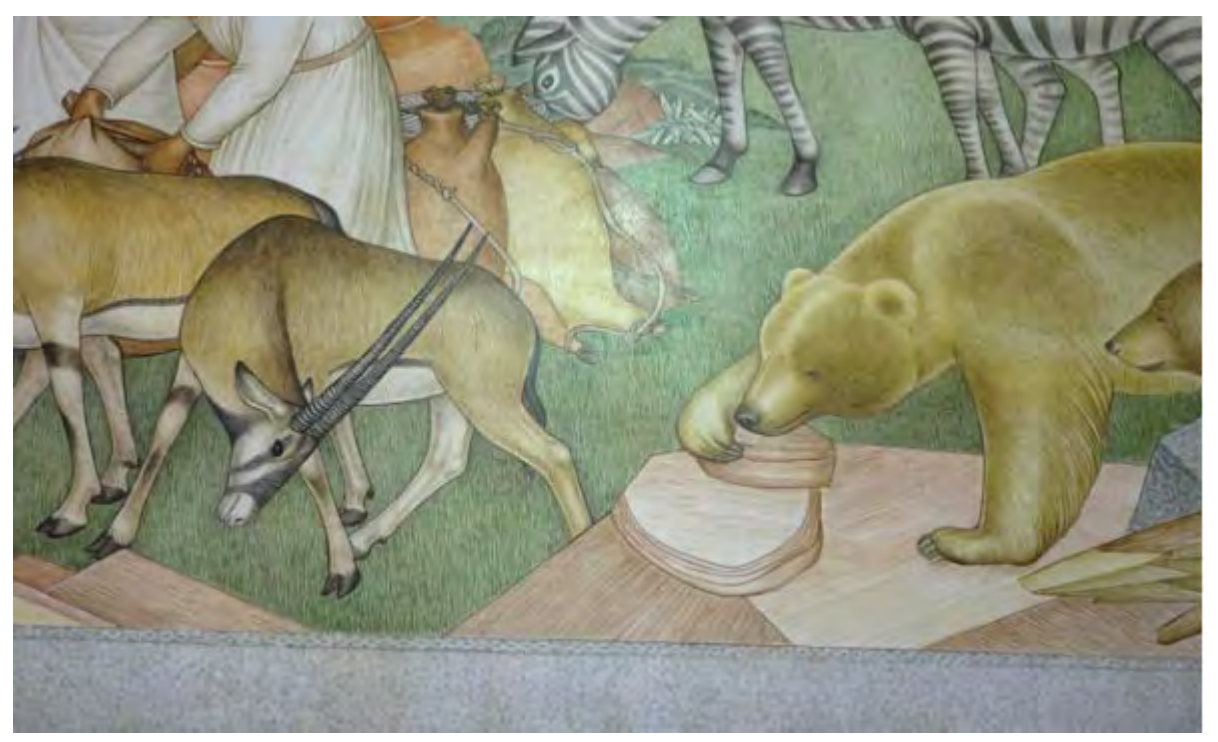
{\it Mother's Building, west wall of main lounge, detail from {\it Loading of the Animals}, 2016.}