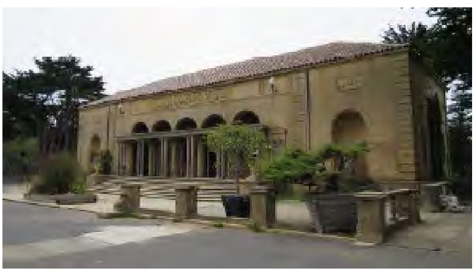
Mother's Building, east elevation and terrace/plaza, view southwest, 2015.