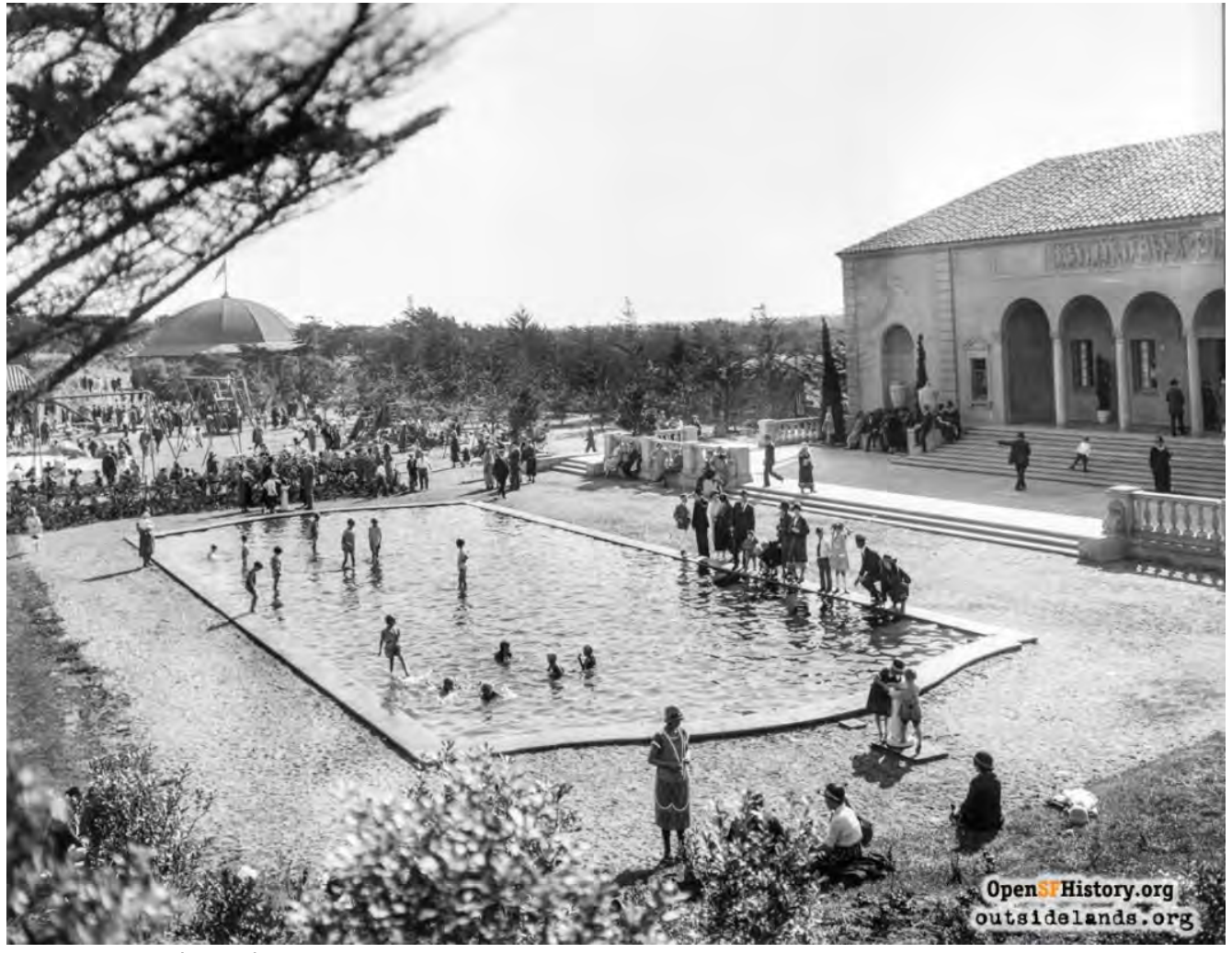
Wading pool in front of Mother's building, carousel and playground in background, circa 1925.

April 3, 1947