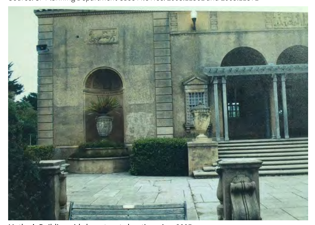
Mother's Building, side bay at east elevation, circa 2005.