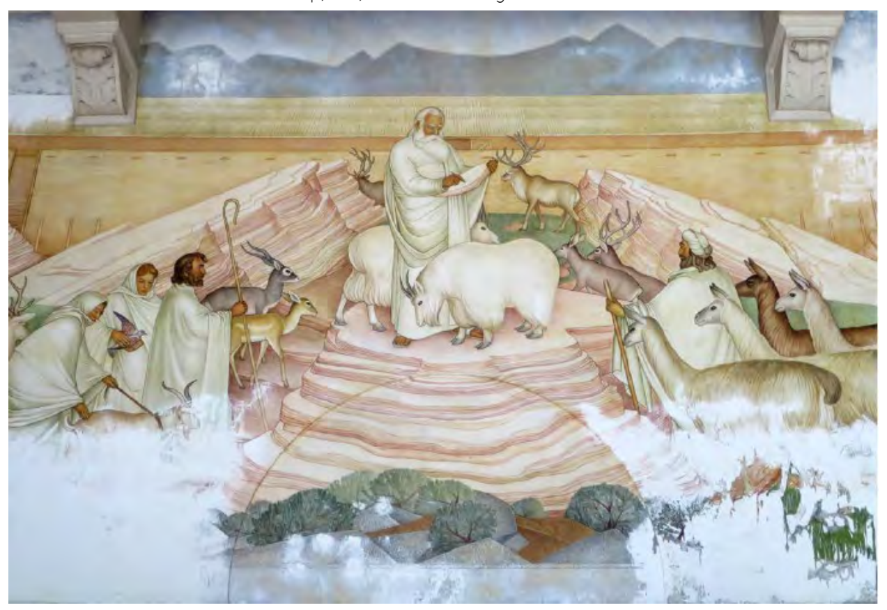
Mother's Building, west wall of main lounge, detail of Loading of the Animals , 2016.