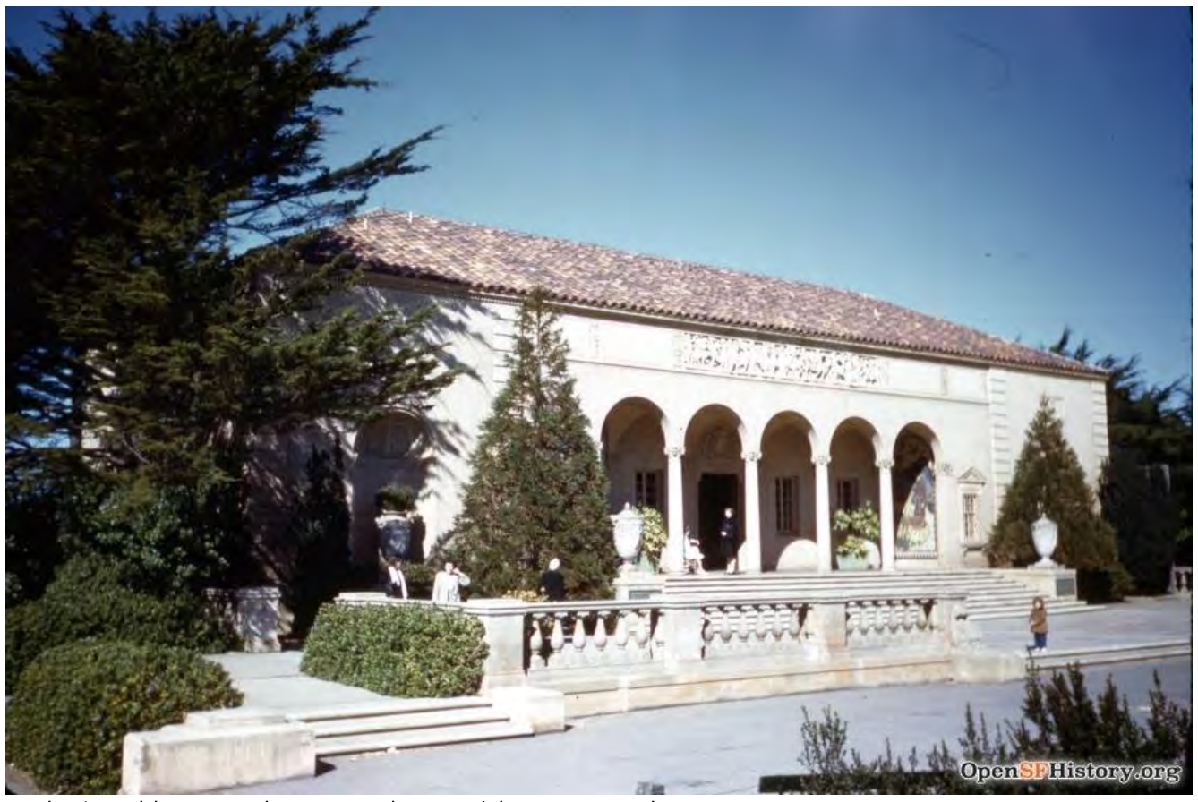
Mother's Building, east elevation and terrace/plaza, view northwest, circa 1945.