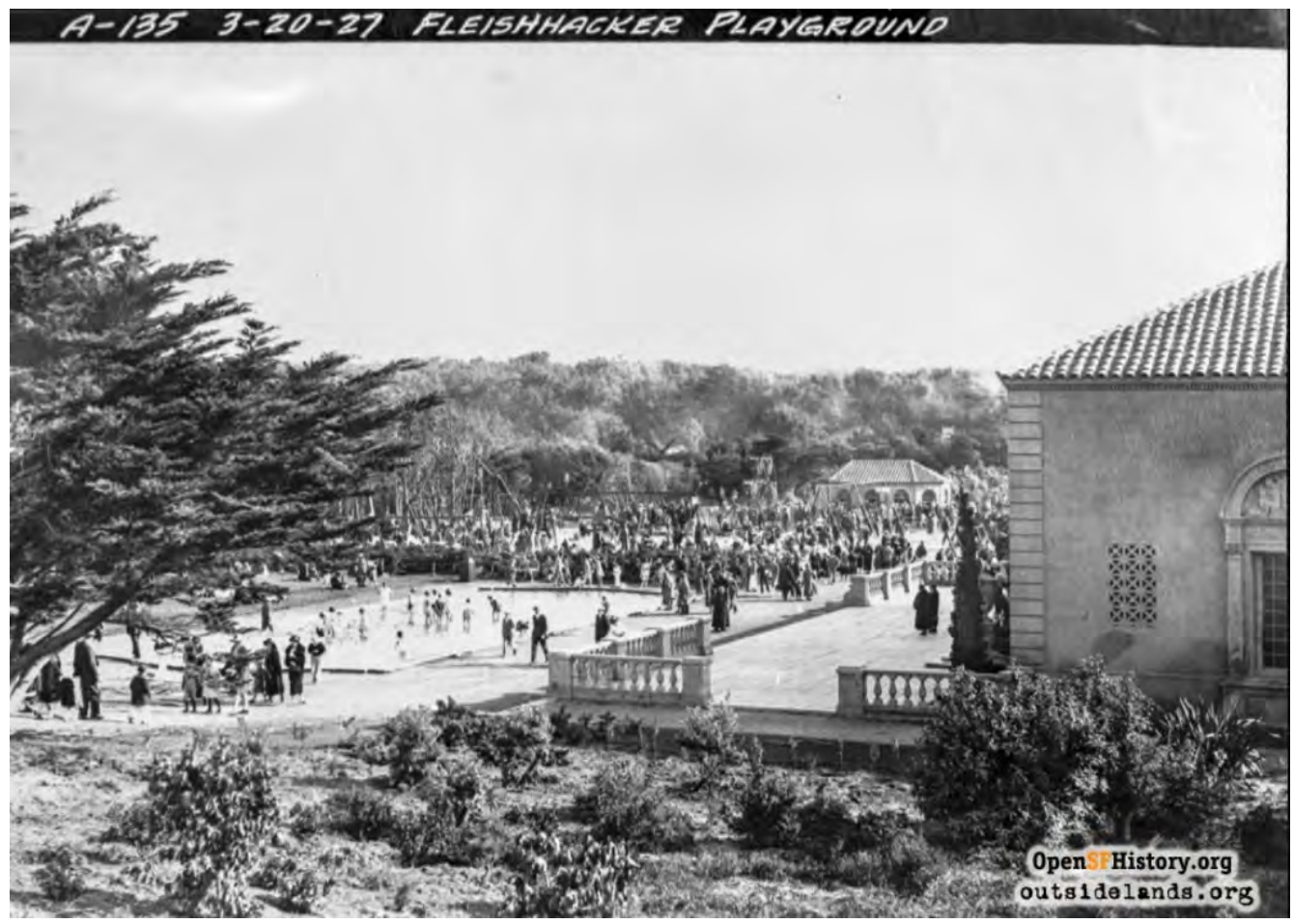
Fleishhacker Playground with north elevation of Mother's Building at right, March 20, 1927.