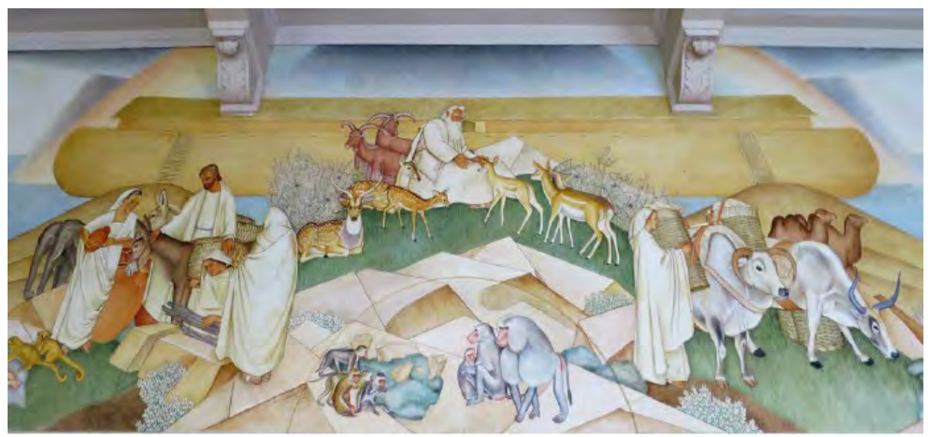
Mother's Building, The ArkfflPassengers Disembarkz on east wall of main lounge, 2016