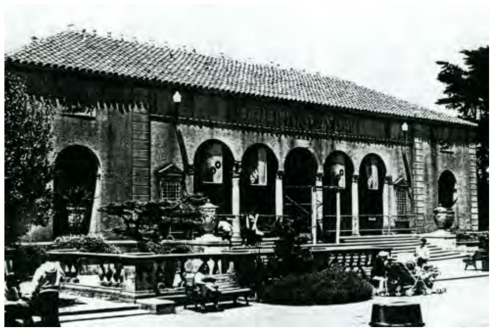
Mother's Building, east elevation, circa 1996.