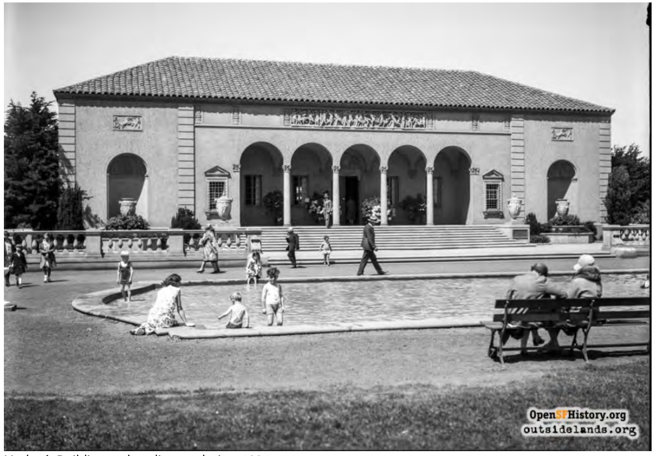
Mother's Building and wading pool, circa 1934