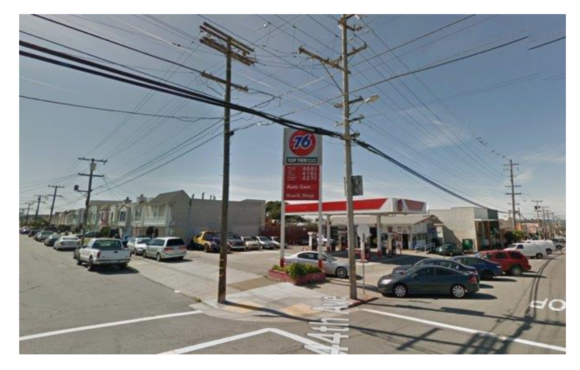
Before photo, taken March 2014

Existing use: 12-unit mixed-use building with Gus's Community Market on the ground floor