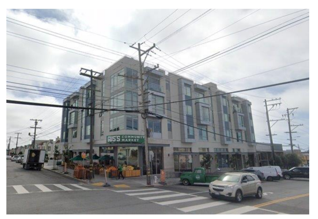
New construction, taken March 2022