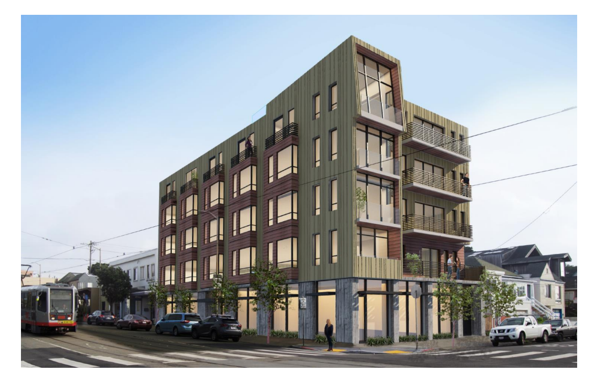
Proposed project, entitled November 2019