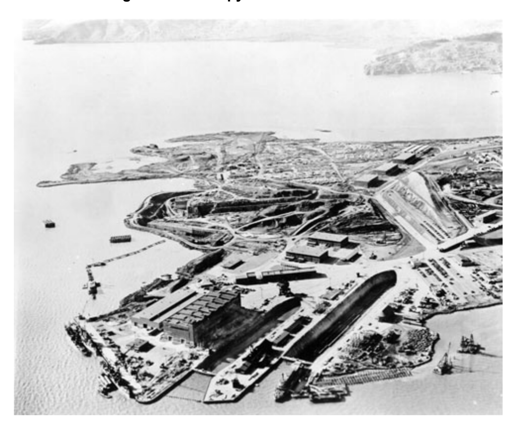
Figure 1: The Shipyard Under Construction

The history of the Hunters Point Shipyard begins in 1867, when the first dry dock opened on the peninsula.<sup>1</sup> In 1941, the Navy bought the site, recruited tens of thousands of workers, and turned the Shipyard into a major repair and maintenance facility for warships. Through 1944, the Navy built four new large dry docks, and expanded the peninsula by smashing an adjacent hill into gravel and dumping it into the Bay.<sup>2</sup> Figure 1 shows the work in progress.<sup>3</sup>