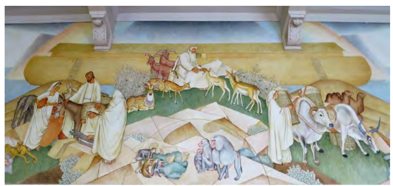
Mother's Building, The Arkf&lPassengers Disembarkz on east wall of main lounge, 2016