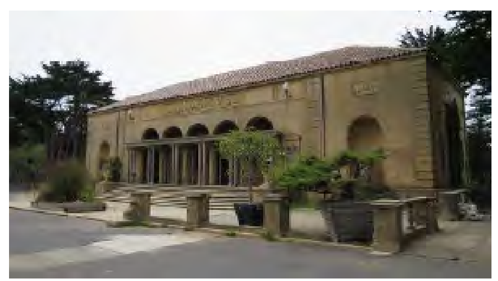
Mother's Building, east elevation and terrace/plaza, view southwest, 2015.