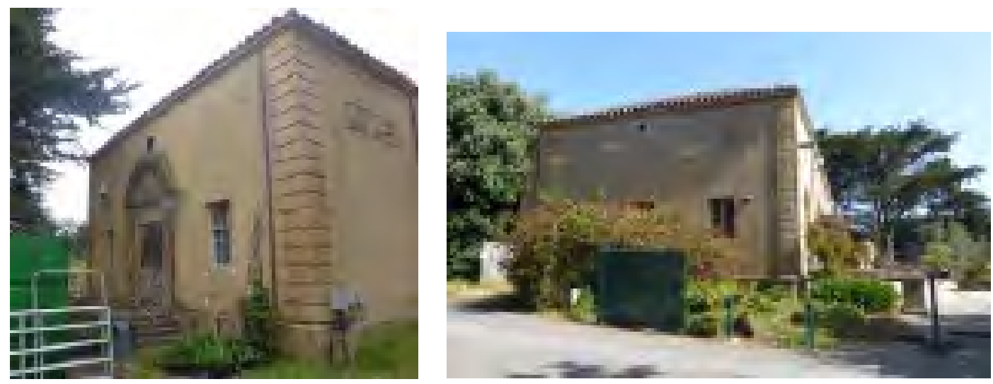
Mother's Building, north elevation (L) and south elevation (R), 2015.