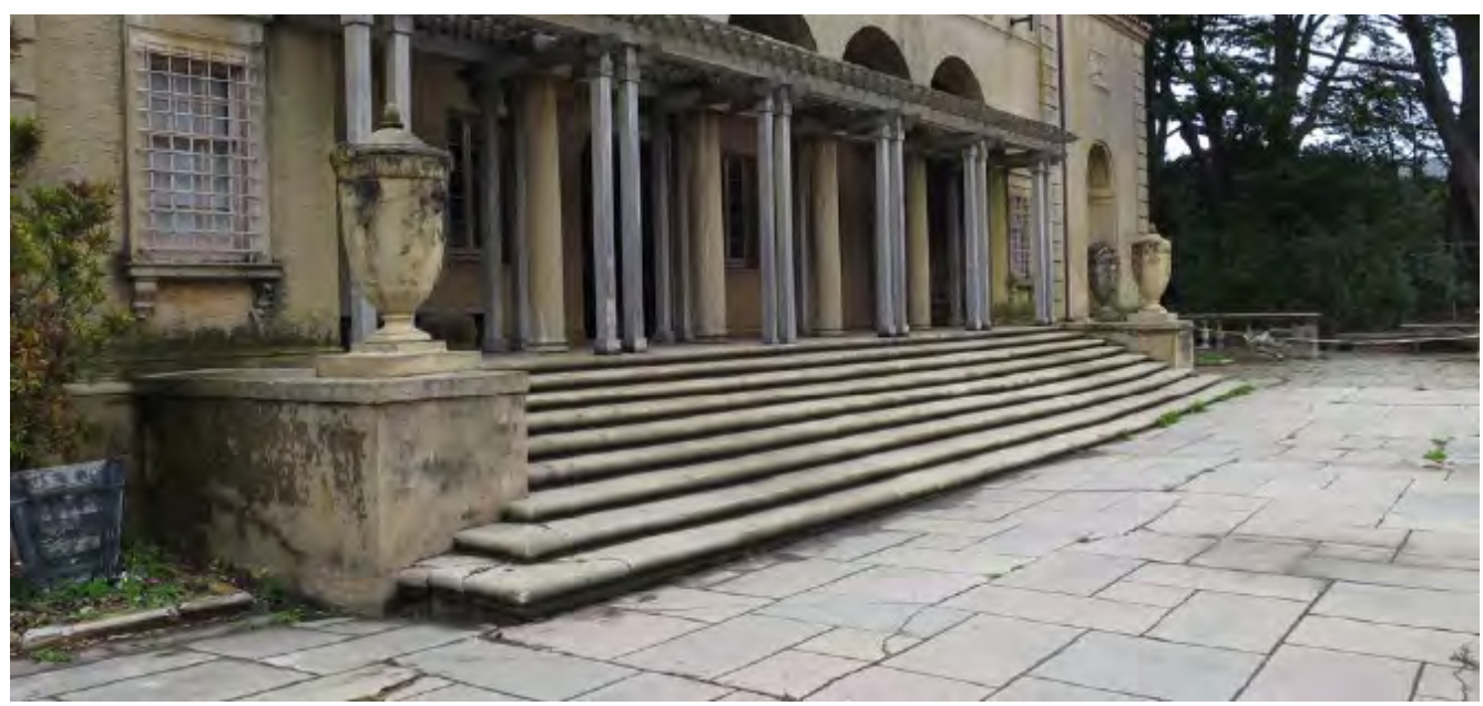
Mother's Building, terrace/plaza and entrance stairs at east elevation, view northwest, 2016.