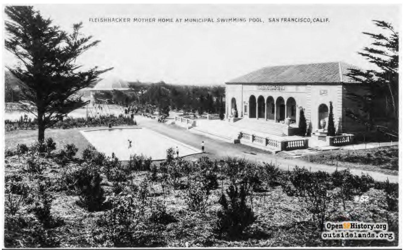
Mother's Building with playground and wading pool and merry-go-round in background, circa 1925.