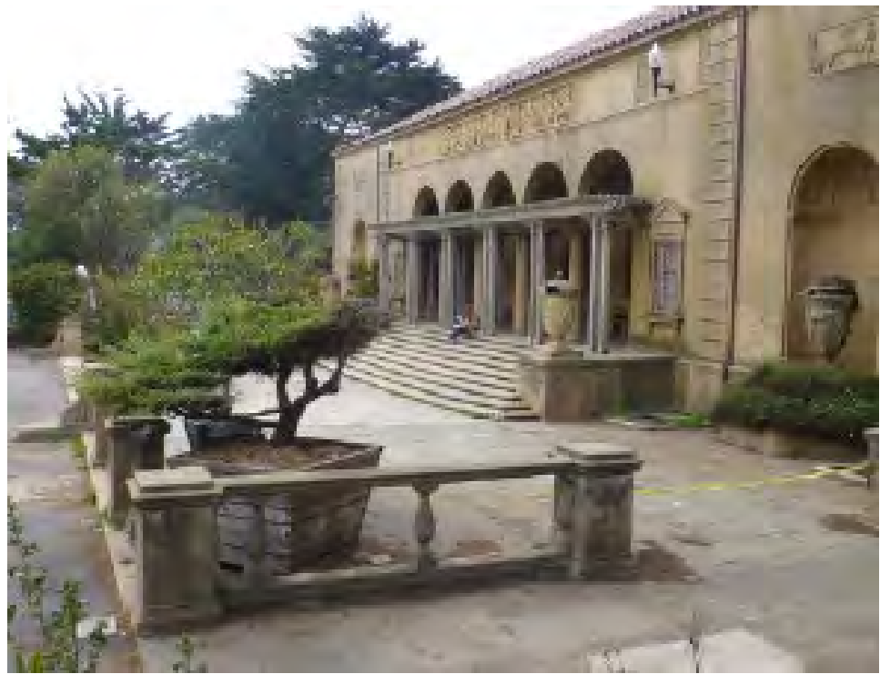
Mother's Building, east elevation and terrace/plaza, view south, 2015.