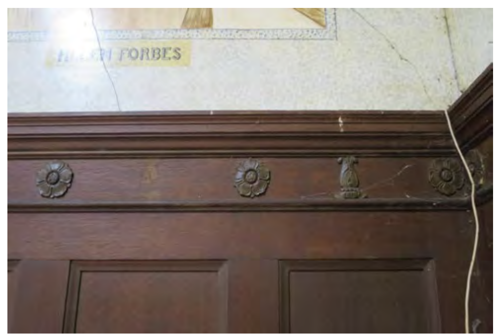
Mother's Building, detail of metal motifs at wainscoting in main lounge, 2016.