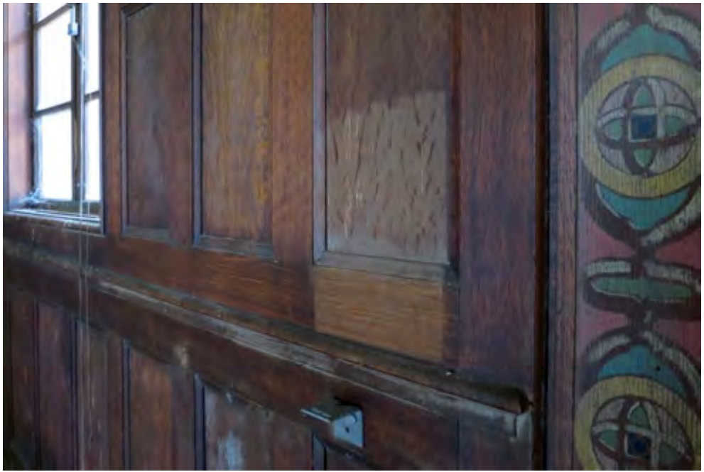
Building, detail of painted door surrounds in main lounge, 2016 .