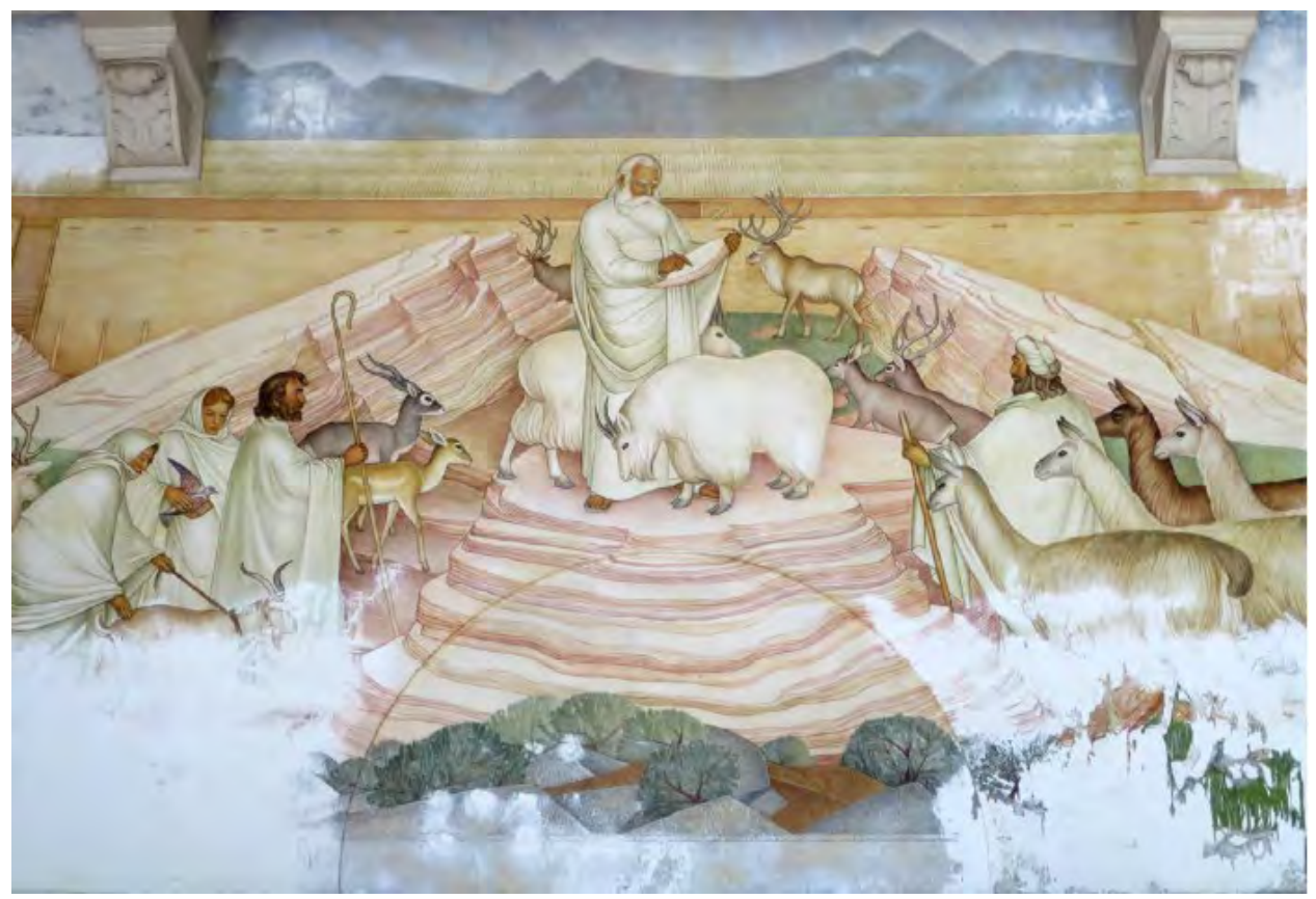
Mother's Building, west wall of main lounge, detail of Loading of the Animals , 2016.