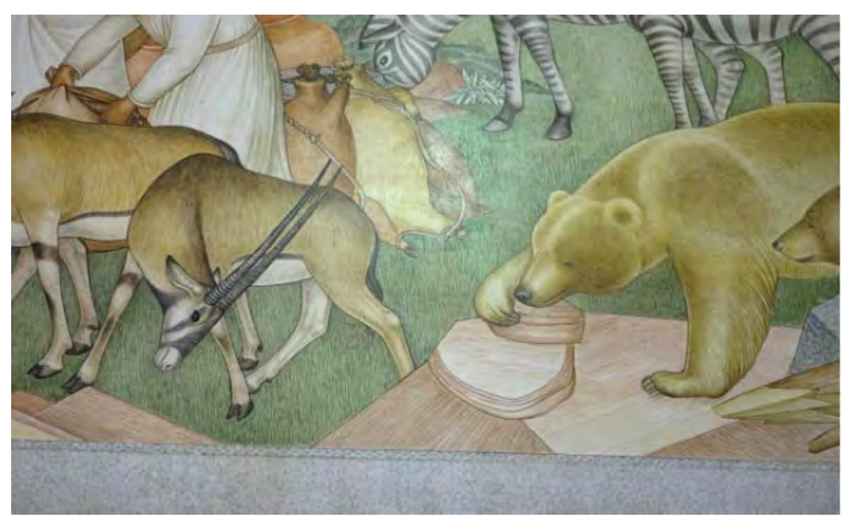
Mother's Building, west wall of main lounge, detail from Loading of the Animals , 2016.