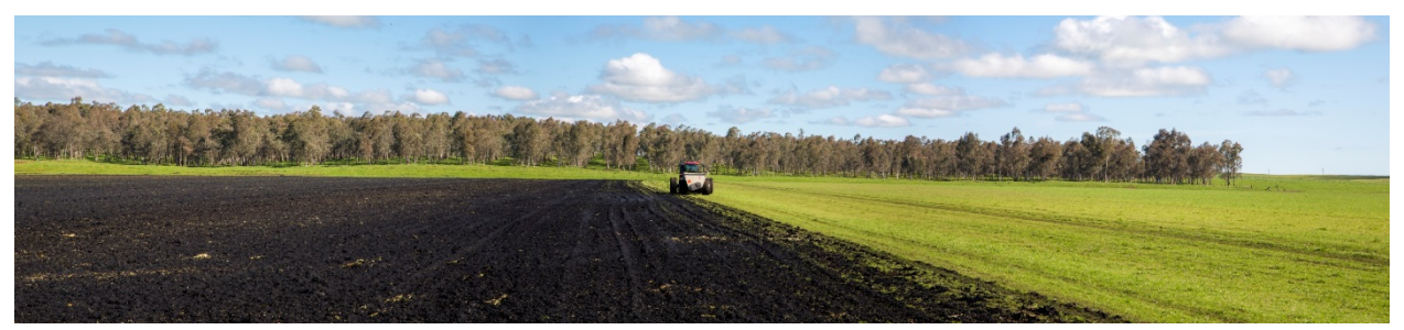
SFPUC Biosolids being applied to farm land

For more information about Biosolids or other SFPUC projects and programs, contact SFPUC Communications at 415-554-3289 or visit www.sfwater.org.