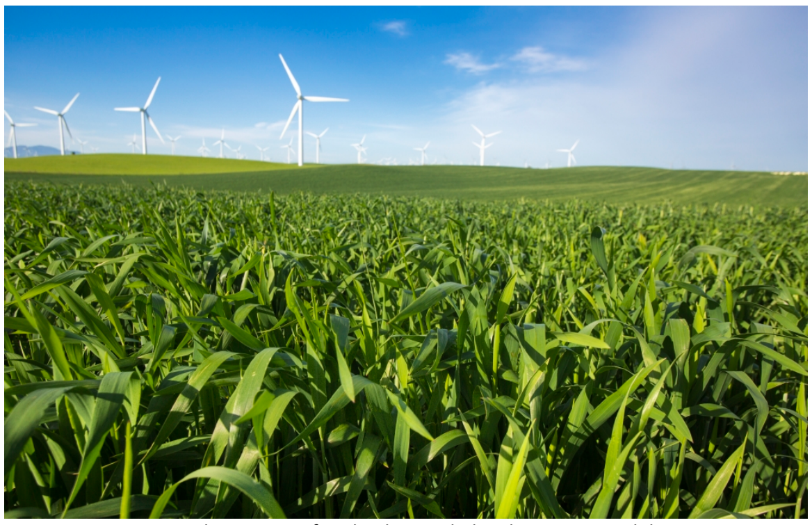
Triticale grown on farmland amended with SFPUC Biosolids