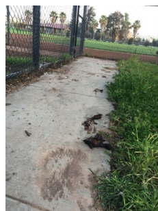
More human shit

All photos are from one small park in San Francisco - James Rolph Jr. Playground, located at 2850 Cesar Chavez St., San Francisco, CA 94110. Link to 400+ additional photos.