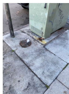
More human shit