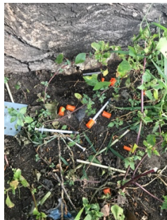
Needles left by illegal campers