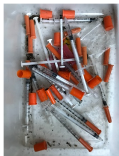
Needles collected from the playground