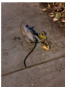
Dead rat next piles of food