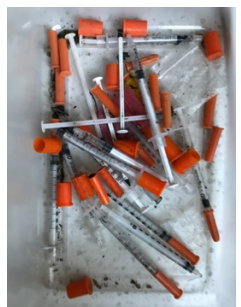
Needles collected from the playground