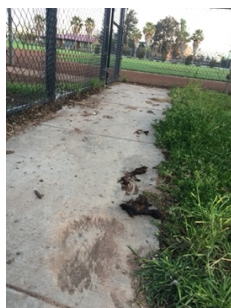
More human shit

All photos are from one small park in San Francisco - James Rolph Jr. Playground, located at 2850 Cesar Chavez St., San Francisco, CA 94110. Link to 400+ additional photos.