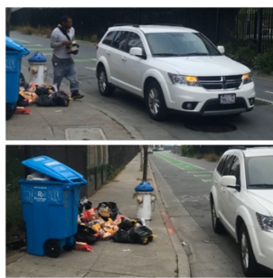
This woman dumps rotting food on the street daily