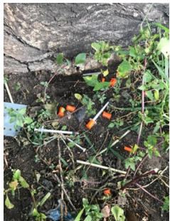
Needles left by illegal campers