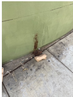
Human shit next to a locked public toilet