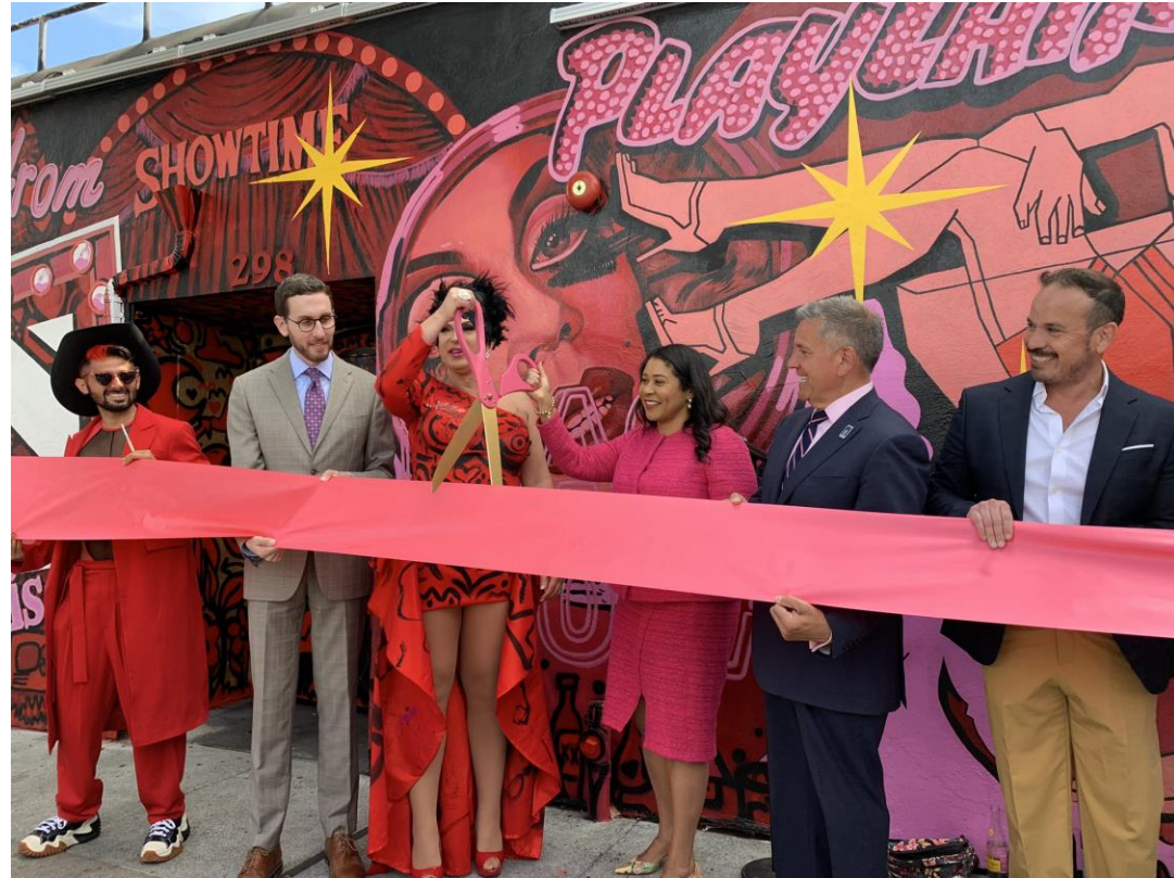
Showtime, Oasis Mural 2022