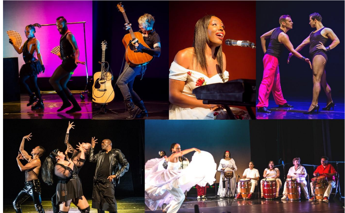
Fresh Meat Festival