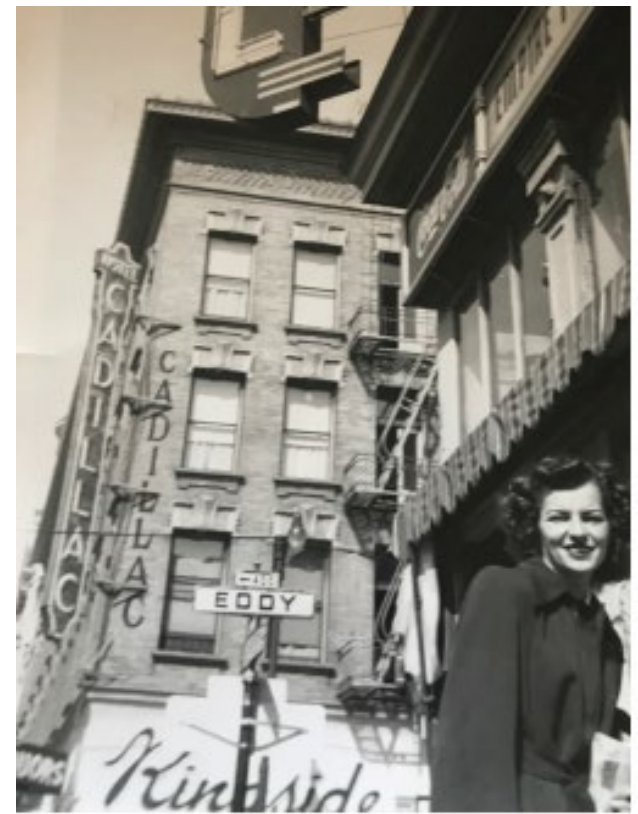
Figure 1: Historical photo of Cadillac Hotel circa 1940

The Tenderloin Museum is located on the ground floor of the Cadillac Hotel, a historic Residential Hotel. Signs proposed for Residential Hotels, such as Cadillac Hotel, are considered Identifying Signs<sup>3</sup>. The Cadillac Hotel / Tenderloin Museum is seeking to restore a blade sign at the property (see Figures 1-3). These blade signs are considered "Projecting Signs" under the Planning Code since they project out and extend beyond either the street property line or building setback. The Cadillac Hotel / Tenderloin Museum have worked with Neon Sign experts at SF Neon to design a replica of the historical sign noting the appropriate size and colors. Part of the process has also included adding a noncommercial on the other side that says "Tenderloin" to pay homage to the neighborhood. The Tenderloin Museum received Community Challenge funding, which is awarded to civic beautification projects to improve neighborhoods.