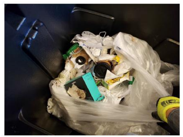
Aluminum foil, paper cups, plastic lids, and clean paper belong in the Recycling. Soiled paper belongs in the Composting. Masks, foam, plastic film, and plastic bags belong in the Trash.