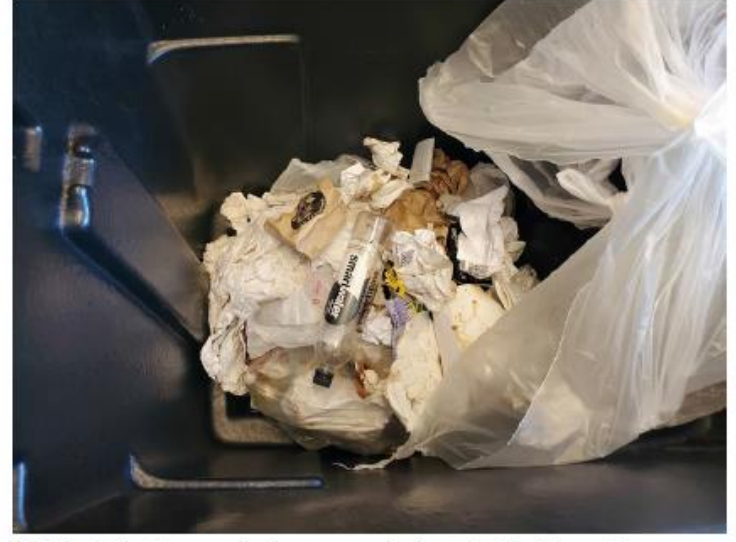
6. Plastic bottles and clean paper belong in the Recycling. Compostable paper cups, untreated wood sticks, and soiled paper belong in the Composting. Plastic bags and soft plastic belong in the Trash.