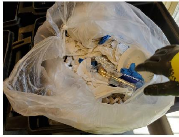
Latex gloves, plastic bags, plastic film, and masks belong in the Trash. Plastic bottles and aluminum foil belong in the Recycling. Soiled paper belongs in the Composting.