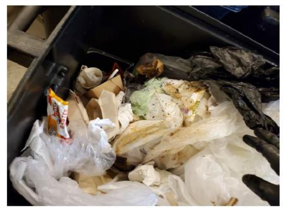
Paper cups and plastic utensils belong in the Recycling. Compostable bags and soiled paper belong in the Composting. Mylar, plastic film, and plastic bags belong in the Trash.