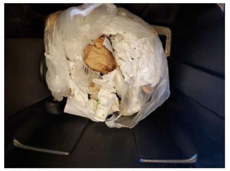
Plastic bottles belong in the Recycling. Compostable paper cups and soiled paper belong in the Composting. Plastic bags belong in the Trash.