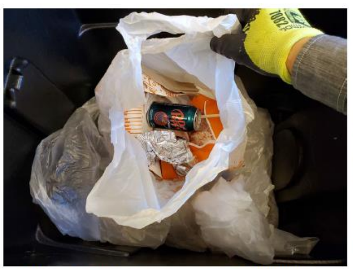
Mylar and plastic bags belong in the Trash. Aluminum cans belong in the Recycling. Soiled paper belongs in the Composting.