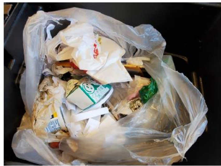
Clean paper, plastic containers, and aluminum foil belong in the Recycling. Soiled paper and compostable bags belong in the Composting. Plastic film and plastic bags belong in the Trash.