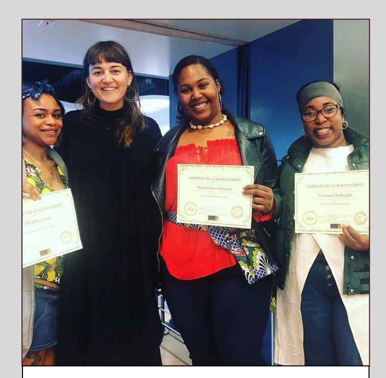
2019 SHEC grads, two of whom have since begun working for SFUSD.