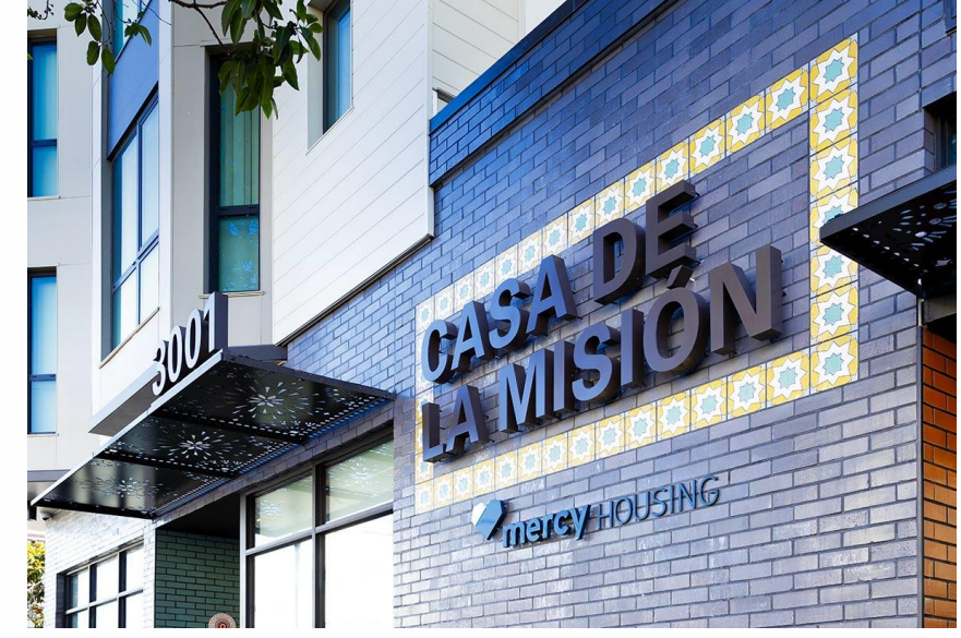
Housing for older adults at Casa de la Mision.