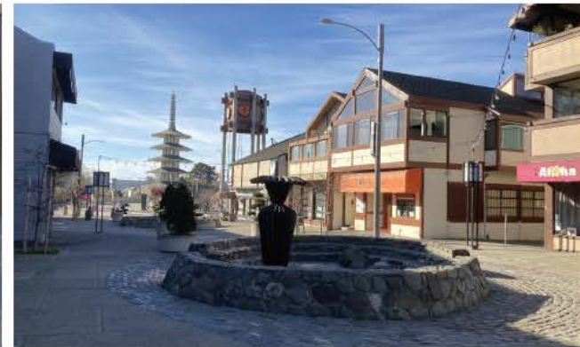
RUTH ASAWA BUCHANAN STREET MALL Post Street to Sutter Street