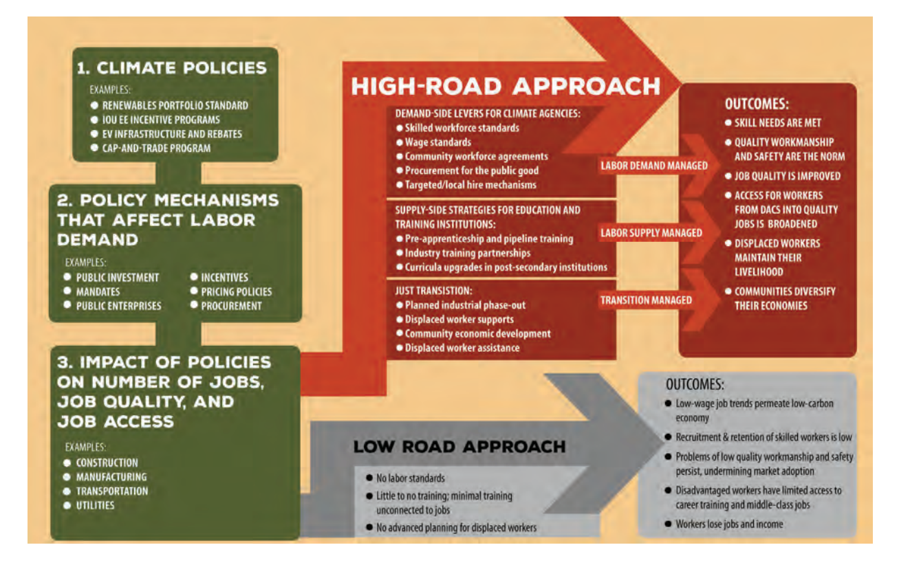
Figure 5: Visual depiction of California's high road workforce training approach.

To achieve these goals, policymakers should consider labor an investment rather than a cost of the decarbonization transition; focus on the quality as well as the quantity of jobs; and craft deliberate policy interventions to advance job quality and social equity.<sup>206</sup> While San Francisco's CAP and broader decarbonization goals only implicate a portion of the just transition question since the city is home to relatively few carbon-intensive industries at risk of displacement, these principles can nonetheless inform the development of a labor- and workforce-supportive CAP funding plan. Key labor investment strategies for CAP leaders to consider include: