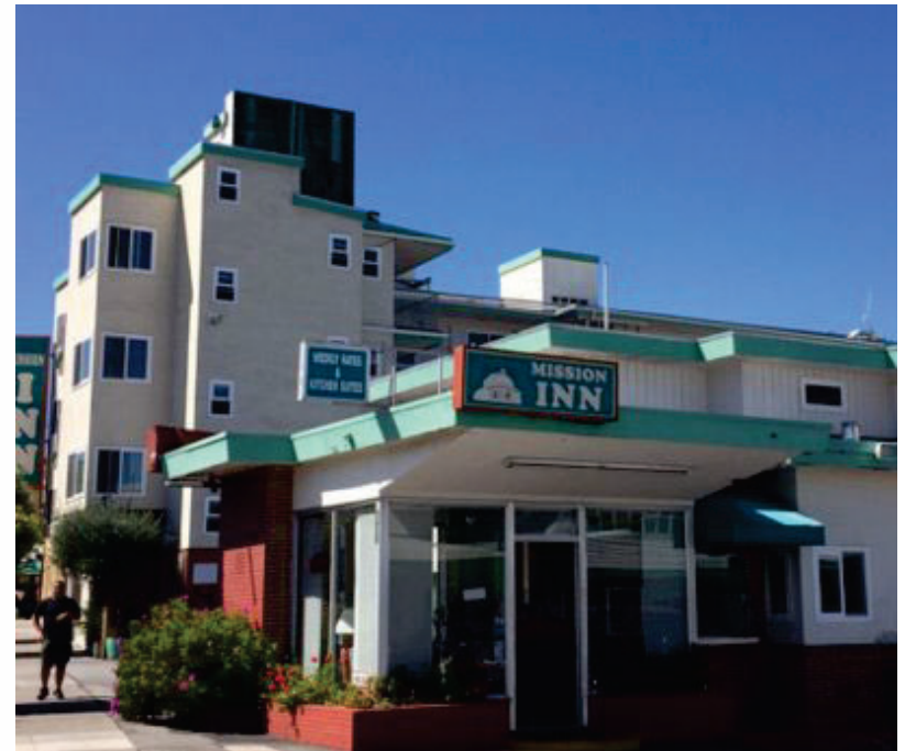
Property at 5630 Mission Street