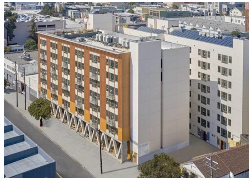
Property at 333 12 th Street