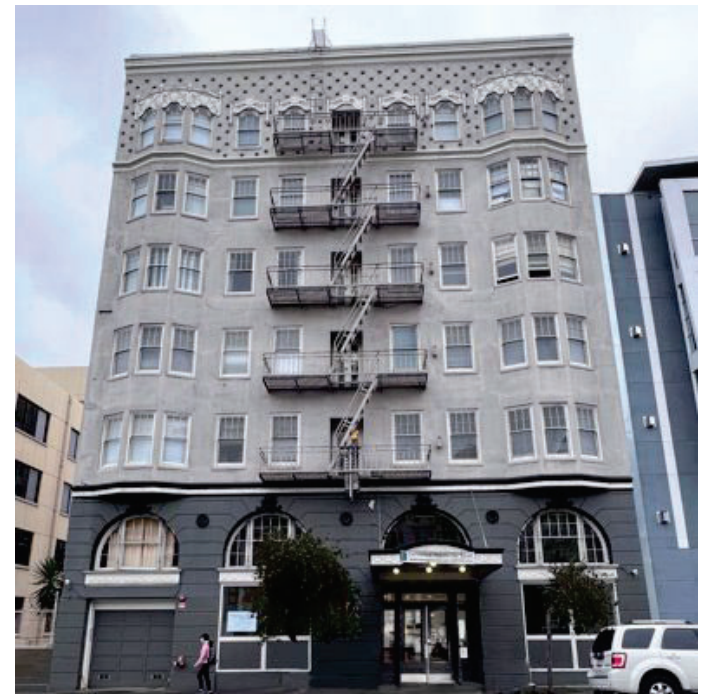
Property at 835 Turk Street