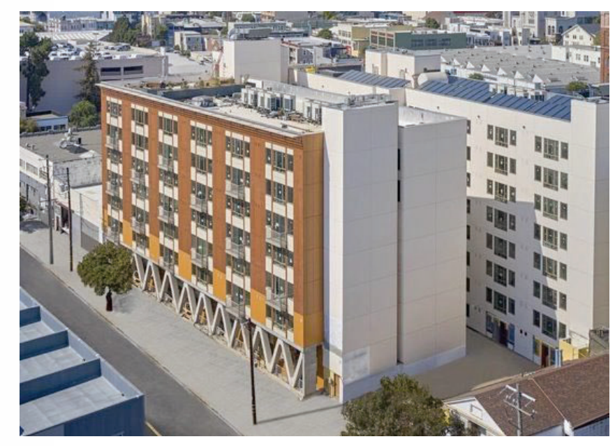
Property at 333 12<sup>th</sup> Street