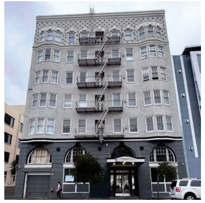
Property at 835 Turk Street