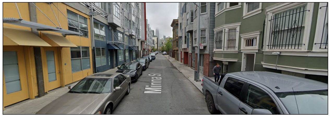
500 Block of Minna St (DAC Census Tract 176.01; South of Market Neighborhood)

Street tree planting will take place in Severely Disadvantaged Community (SDAC) and Disadvantaged Community (DAC) areas in the tree canopy-poor Tenderloin and South of Market neighborhoods. These highly urban areas have a lack of tree canopy making them more vulnerable to extreme heat and other public health impacts. Some typical street conditions are shown in the photos below. The grant project will provide funding for concrete removal to make room for planting trees where currently no trees or tree basins exist. This will provide significant opportunities for increased greening.