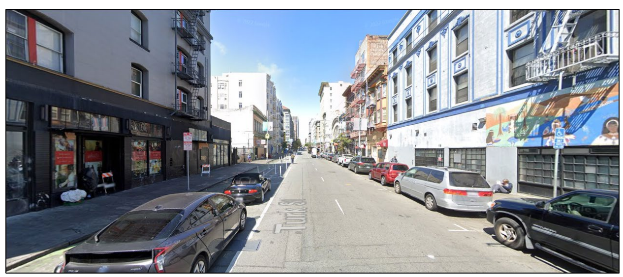
100 Block of Turk St (SDAC Census Tracts 125.01 and 125.02; Tenderloin Neighborhood)