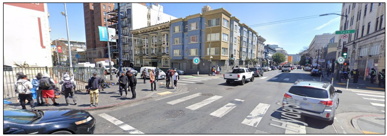
Hyde St and Turk St (SDAC Census Tract 124.01; Tenderloin Neighborhood)