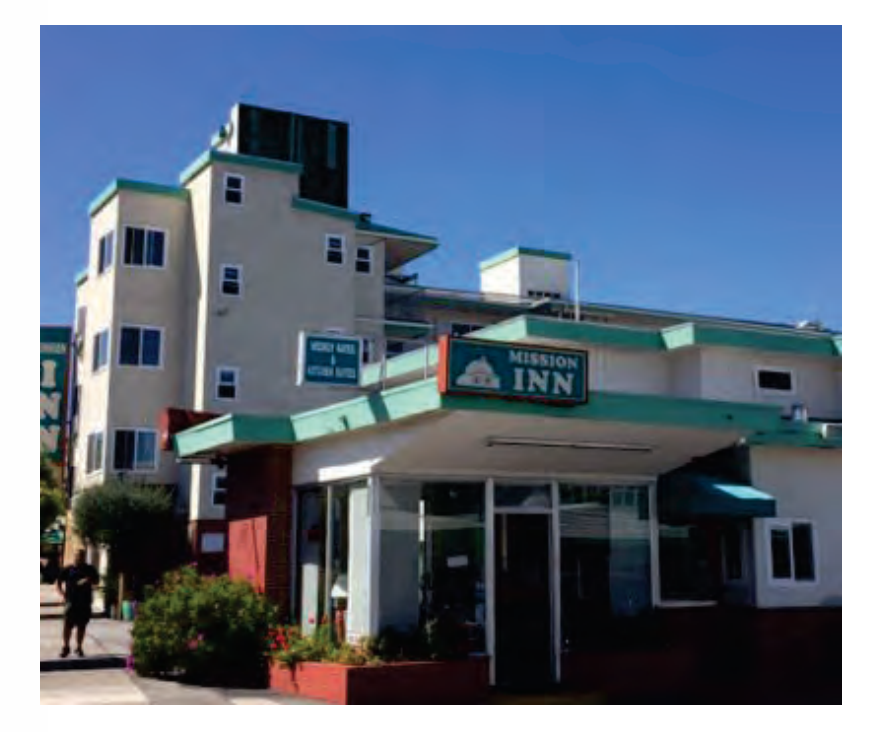
Property at 5630 Mission Street