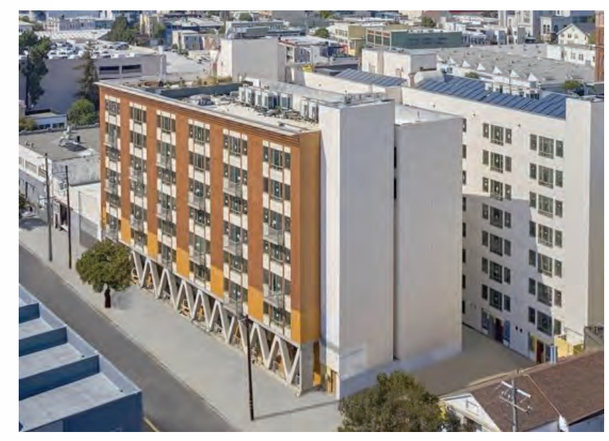
Property at 333 12th Street