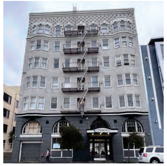
Property at 835 Turk Street