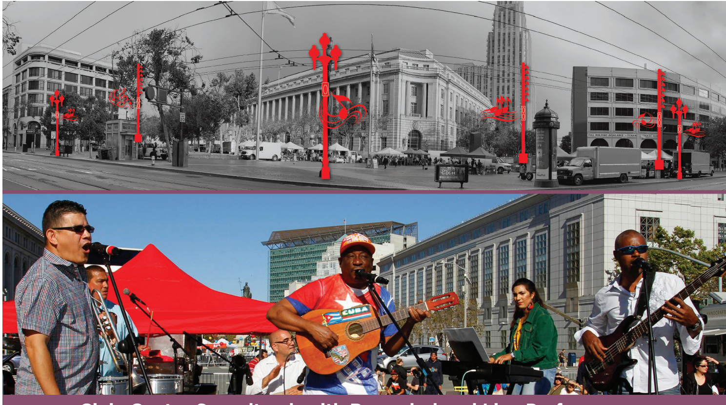
Civic Center Soundtrack with Recorded and Live Performances

A CCCBD project in partnership with the Planning Department and Recreation and Parks Department