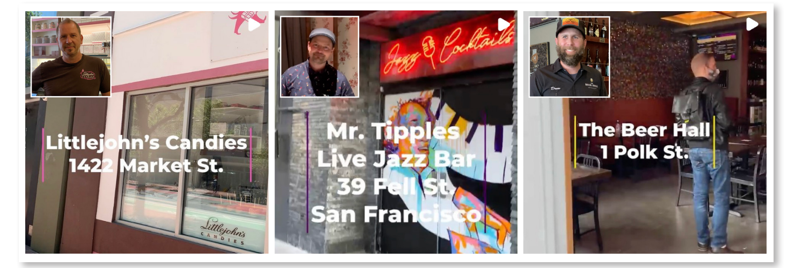
Watch CCCBD's small business promotional videos on our website

CCCBD's street banner campaign announced the reopening of the District's performing arts venues