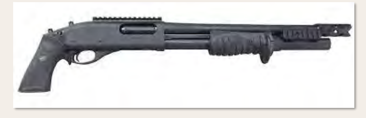
Fiscal Impact : Initial $1266. Minimal maintenance costs

Used ONLY by trained members within the SRT to defeat locked, barricaded or fortified locations allowing deputies to conduct rescues or high-risk forcible entries during high risk and critical incidents. Breaching slugs shall not be utilized outside of training, criminal apprehensions, critical incidents, exigent circumstances or executing a warrant. Deployed primarily as a breaching tool but may be used as a lethal force option under exigent circumstances.