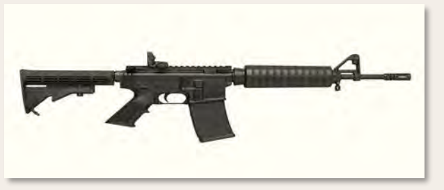
Specialized firearms and ammunition of less than .50 caliber, including assault weapons as defined in Sections 30510 and 30515 of the Penal Code.