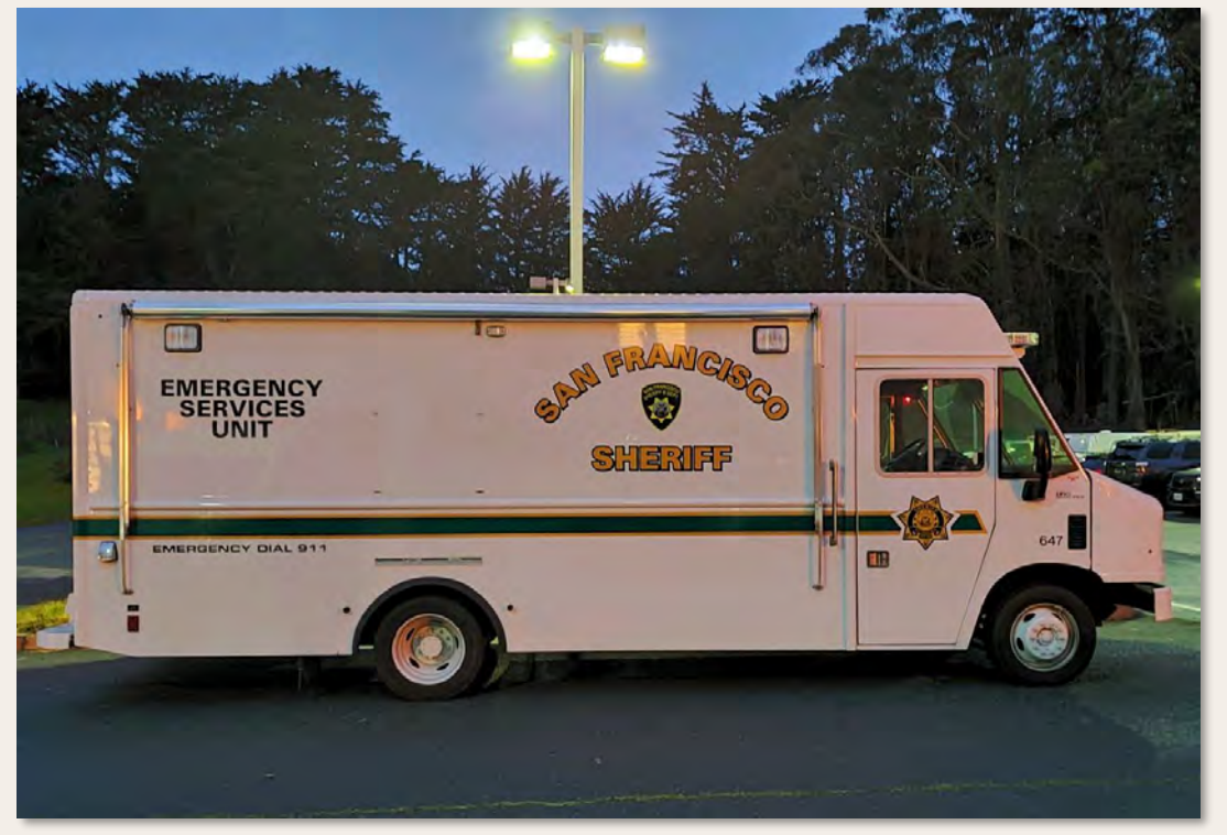
Fiscal Impact: Initial cost $135,000. Estimated annual cost (not including repairs) $740. Lifespan: 200,000 Miles Amount: 1