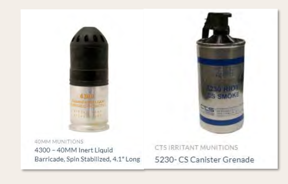
Fiscal Impact: Initial $6452. Annual $200

SRT members shall complete a POST certified SWAT school and training on chemical agents during the annual training cycle.