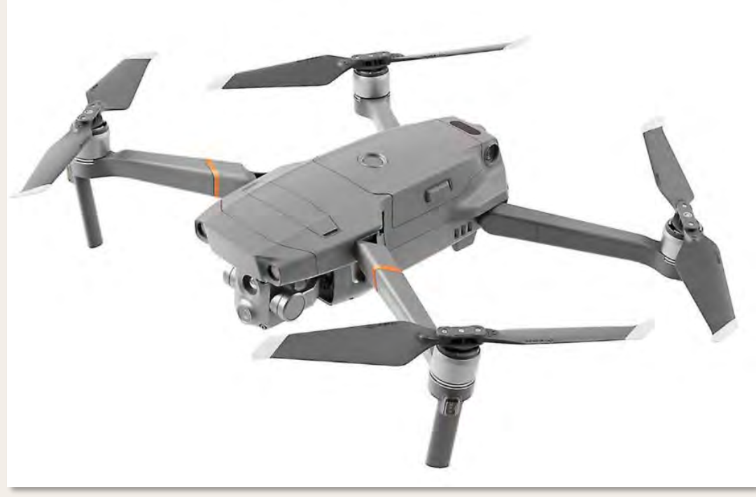
Fiscal Impact: Initial Cost of Purchase $4800.00 Lifespan: Estimated 5 Years | Amount: 2

Only authorized UAS Operators shall be permitted to deploy the UAS. UAS Operators shall obtain supervisor approval prior to conducting a UAS deployment. UAS operations shall only be conducted in accordance with the San Francisco Sheriff's Department FAA Certificate of Waiver or Authorization (COA), or within the guidelines set out in Title 14 CFR, Part 107 (Code of Federal Regulations.) Training will be conducted within established guidelines to ensure operators acquire and maintain proficient UAS skills and knowledge of regulations and safe operating procedures. Only Operators who have completed the required training shall be authorized to operate the UAS. Part 107 Certified / FAA requirement.