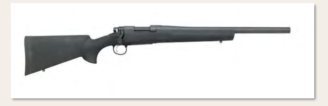
Fiscal Impact: See Cost Slide Lifespan: 15 Years Amount: See Cost Slide

Sniper Rifles may only be deployed by SRT sniper team members. Rifle usage must follow the guidelines of the Use of Force Policy, Firearms policy, Penal Code 835a(c), and Penal Code 33220(b).