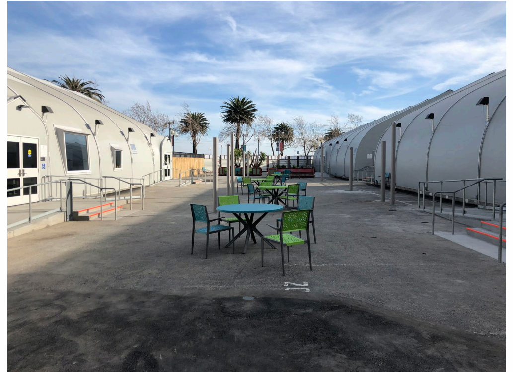
Courtyard at the Embarcadero SAFE Navigation Center.