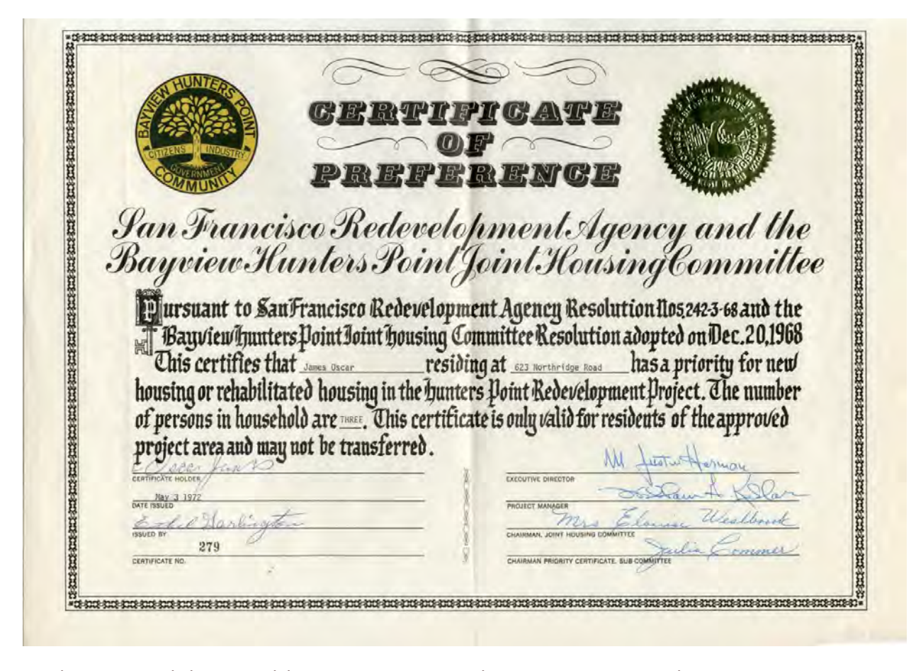
Fig 6a. An original Certificate of Preference, issued by San Francisco Redevelopment Agency Executive Director Justin Herman to a Bayview Hunters Point resident in 1972.

The exponential growth of the African American population in San Francisco during the wartime era proved influential in establishing the city's arts and cultural national profile. African American musicians and artists were increasingly attracted to and visiting the "Harlem of the West"-- a vibrant corridor in San Francisco's Fillmore district that became a gateway for Black jazz musicians thanks to the concentration of Black-owned and Black-serving venues and hotels. The Fillmore Corridor was a vibrant destination for the city's Black population, with restaurants, theaters, hotels, and other businesses that catered to a Black clientele when other businesses in San Francisco providing identical services refused entry to African American people. Business leader Charles Sullivan was foundational in establishing the Fillmore as the cultural epicenter of San Francisco and the region. Additionally, community building was happening in Bayview Hunters Point where there had been rapid housing construction and growing homeownership for African Americans.