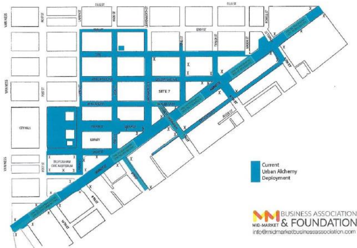
Source: Mid-Market Foundation Deliverable 9