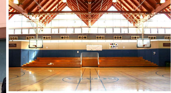
ALTERNATE ENTRY (HARRIET ST)